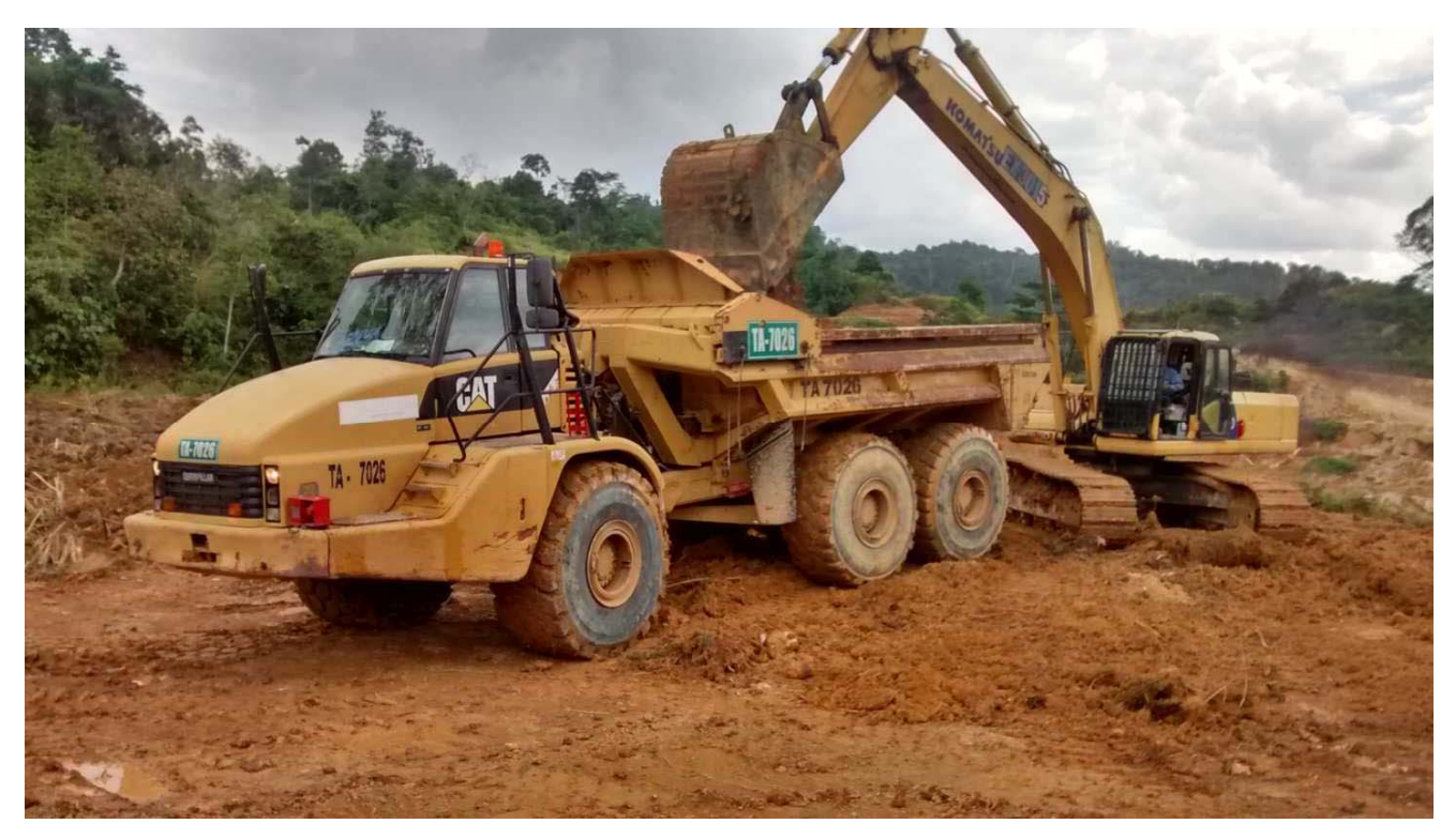
Figure 1. Open pit mining activities commence at Tembang