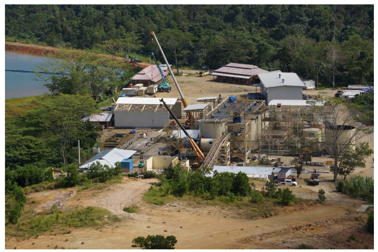
Figure 3. CIL Process Plant and existing tailings storage facility