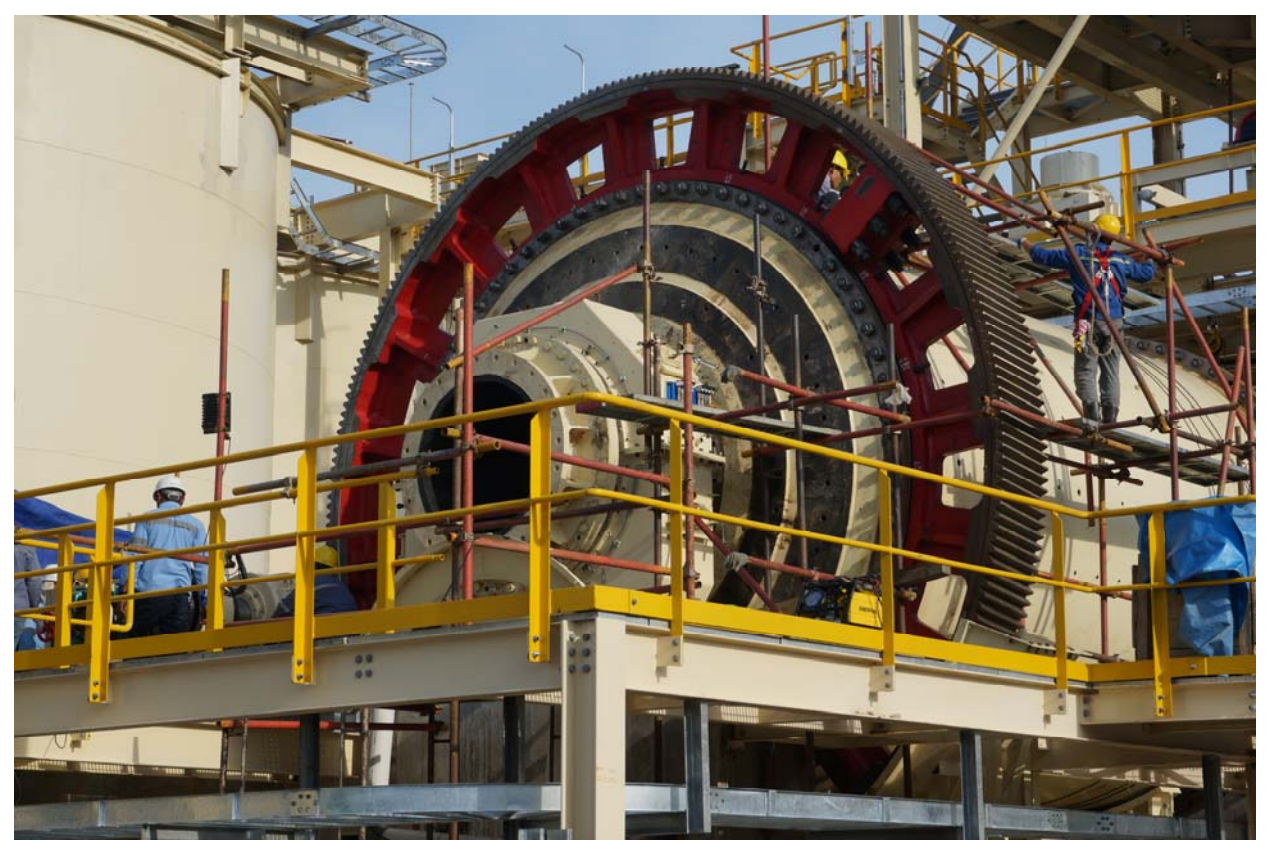
Figure 2. View of both segments of girth installed on the SAG mill