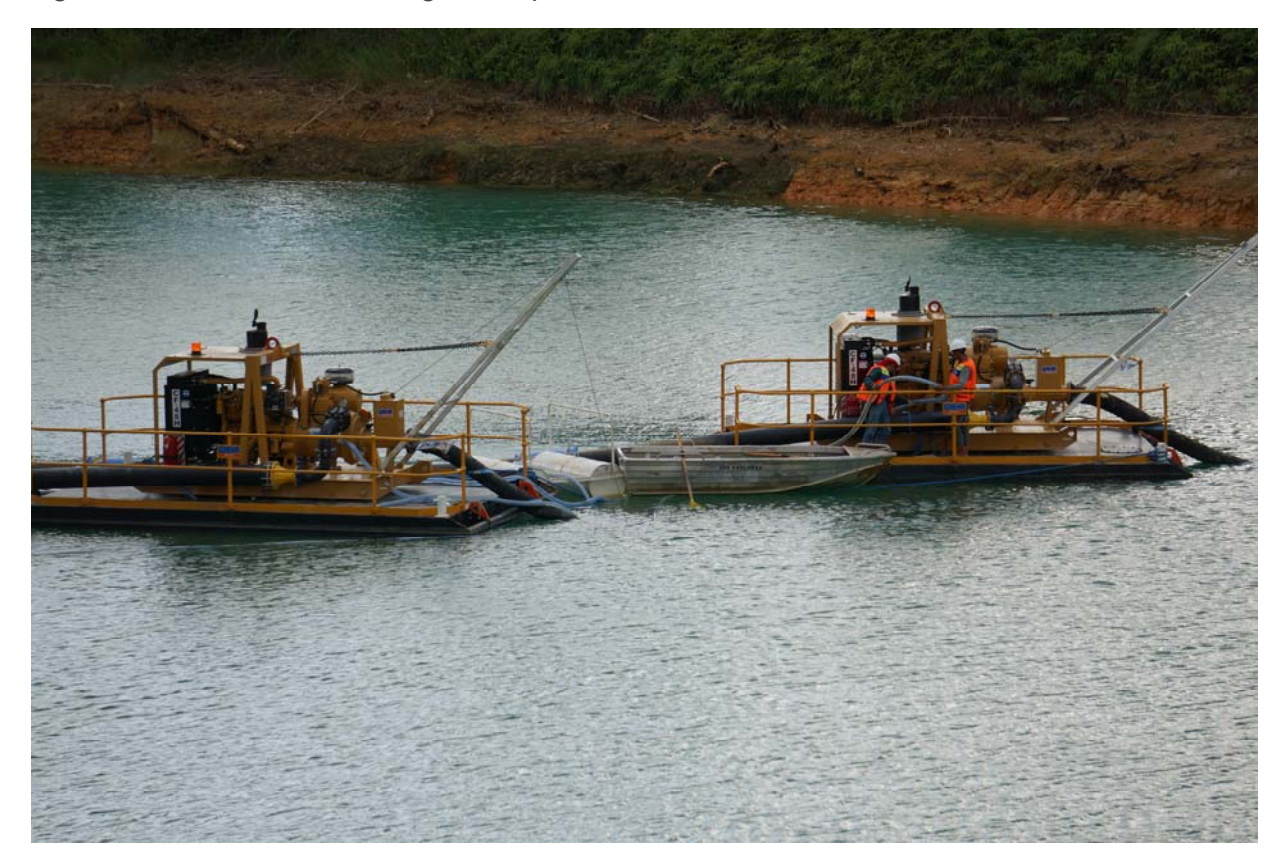
Figure 5. Dewatering activities at the Belinau open pit