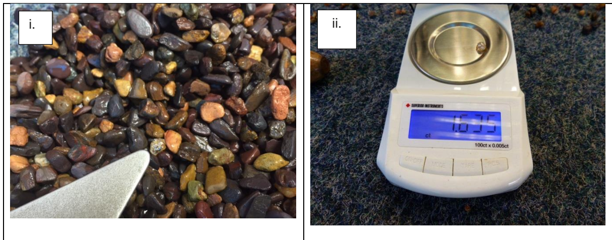
Figure 4. Diamonds from the Save River Diamonds Project. (i.) A 0.44ct stone recovered from Pit 001 and (ii.) A 1.64ct stone recovered from Pit 002.