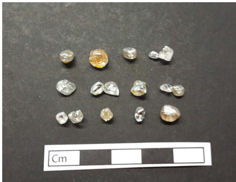
Figure 5: The 16 diamonds recovered from initial sampling (photographed as recovered, prior to cleaning)