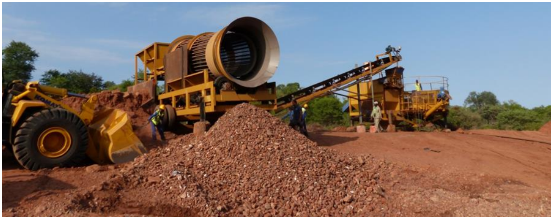
Figure 2: Mustang Trial Mining Plant in operation

The sampling plant and equipment were mobilised to site during the 2014/2015 rainy season and were successfully commissioned on 23 March 2015. Subsequently, gravels from five sample pits close to the plant and the camp were processed. As at 11 June 2015, 16 diamonds have been recovered, lending credence to the exploration model that diamonds may have travelled from Zimbabwe, down the Save and/or Runde rivers and been deposited downstream of their confluence on the Mozambican side of the border (downstream from Murowa and Marange diamond fields in Zimbabwe).