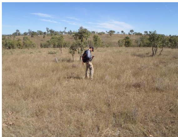
Figure 2: Huntsman Prospect

In addition encouraging geology including quartz stockwork and gossanous quartz veins hosted in basalts were mapped at the Golden Orb Prospect (Figure 3). Assay results for those rock samples have now been received and returned highly anomalous copper, zinc, lead, gold, silver, arsenic and antimony, elements associated with the known Develin Creek copper-zinc-gold-silver massive sulphide deposits.