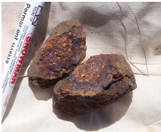
Figure 1: Huntsman Gossan Sample

Recent field reconnaissance mapping identified float samples of new gossans in an area of poor outcrop (Figure 2) within the centre of the Huntsman soil geochemical anomaly, only 3km from known massive sulphide resources at Develin Creek (Figure 1). Rock chip samples of the gossans (weathered surface expression of sulphide zones) returned copper samples up to 1.1% Cu with associated anomalous pathfinder elements gold, arsenic and zinc (Tables 1 and 2). The discovery of well mineralised gossans at Huntsman is an outstanding result and elevates the prospect as a high-priority target for further more detailed exploration follow-up, including: detailed mapping and infill soil geochemical sampling prior to initial drill testing.