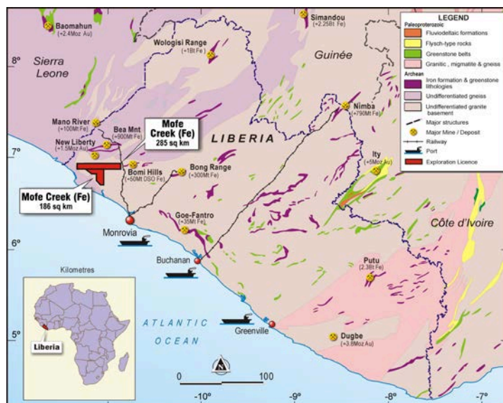
Figure 2 | Mofe Creek Project location

Tawana is committed to becoming a mid-tier iron ore producer through the development of the Mofe Creek project, which covers 475km 2 of highly prospective tenements in Grand Cape Mount County. The Project hosts high-grade friable itabirite mineralisation which can be easily upgraded to a superior quality iron ore product in the 64-68% Fe grade range, for which there is consistent global demand, attracting significant price premiums.