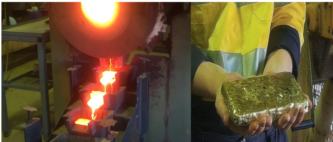
Old Pirate Gold Pour!