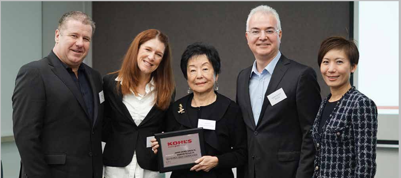
Receiving award as Kohl's Vendor of the Year