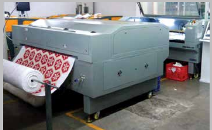
New automated equipment at factories