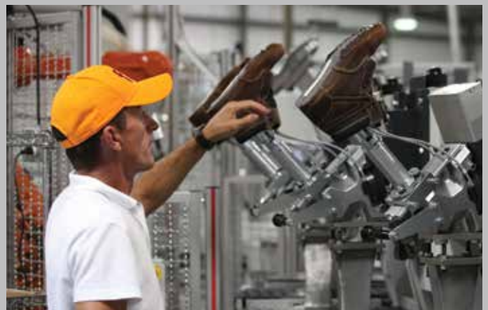
Footwear Industries of Tennessee in full production