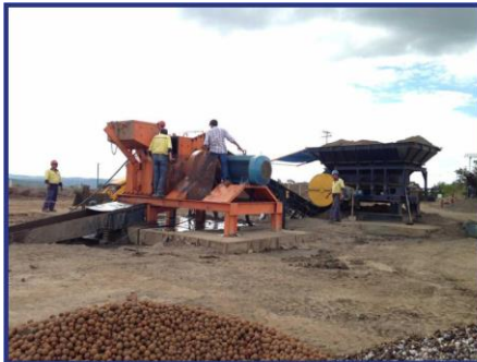
Above: 40 tph Hammer Mill

“Their assistance and understanding has been very much appreciated through this challenging period and I am grateful to have them as part of our extended team.”