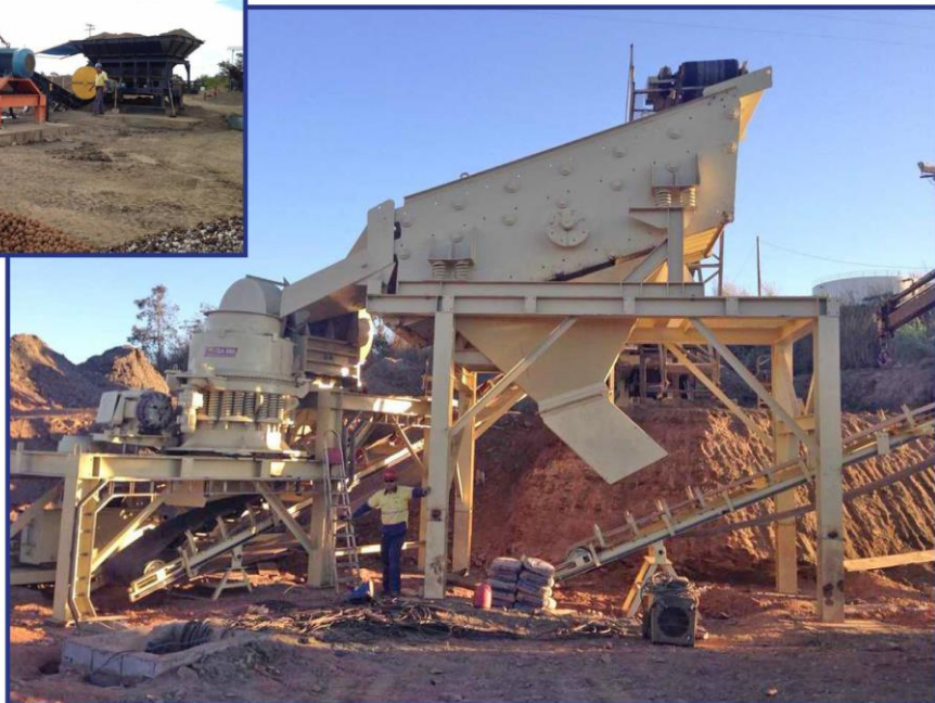
Right: 100 tph Cone Crusher

Total shares: 242.7 million Listed options: 11.4 million Unlisted options: 33.2 million