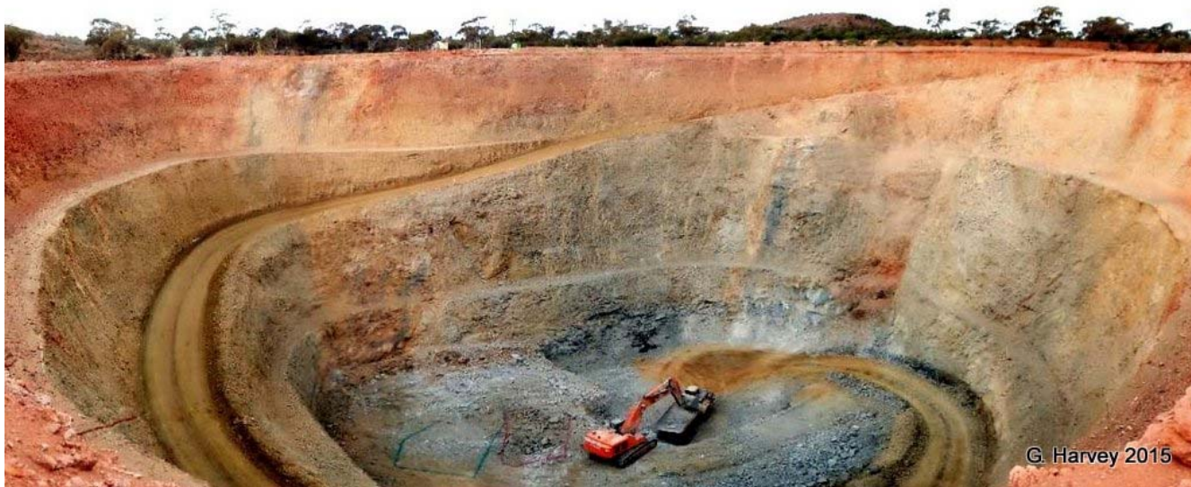
Open-pit mining at Newminster