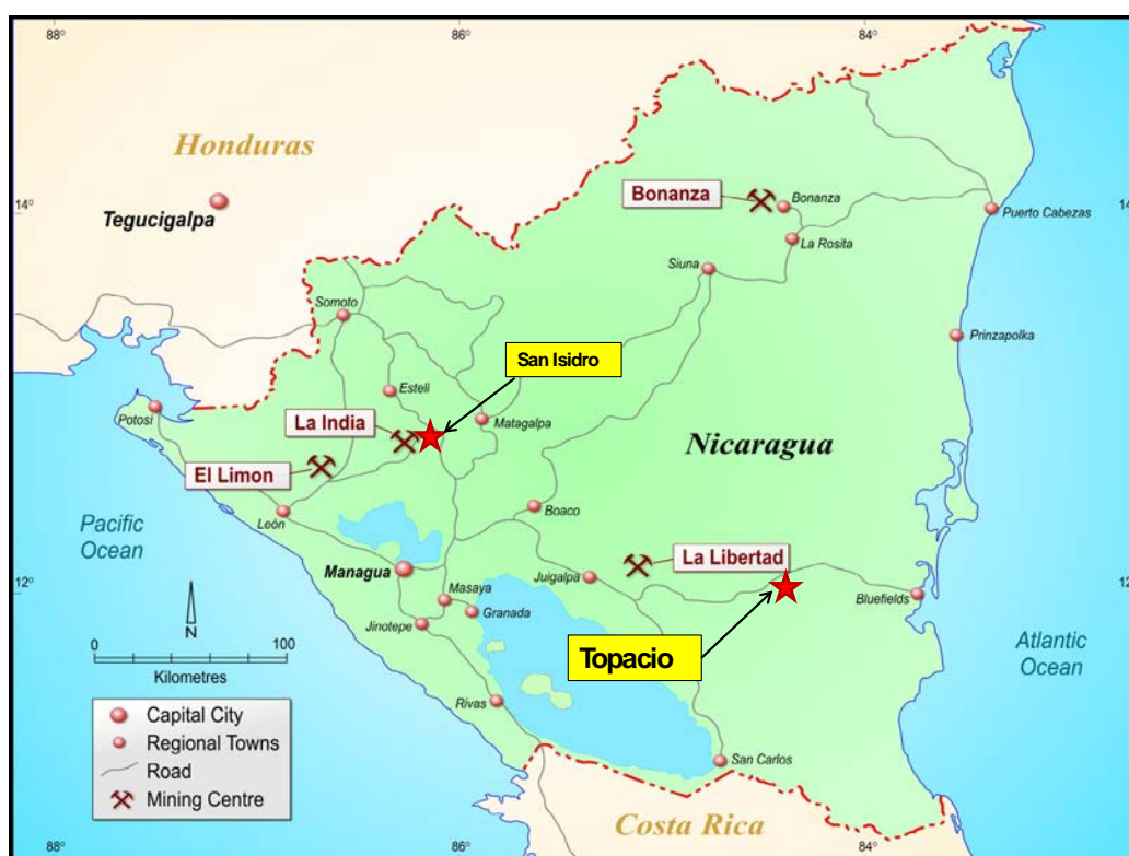
Figure 1 Oro Verde projects and major Nicaraguan gold deposits