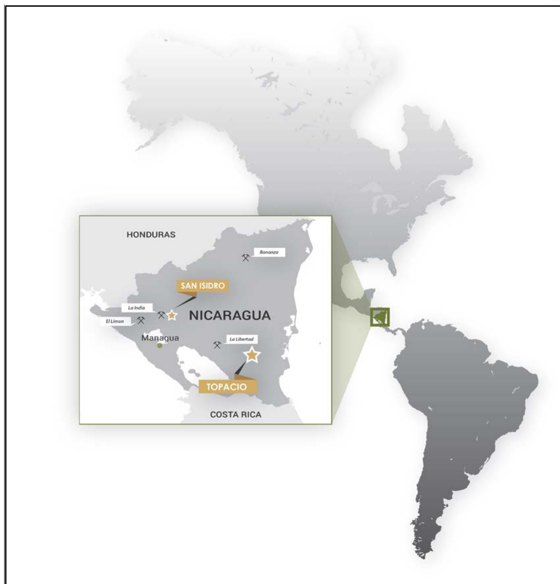
Nicaragua – the Centre of the Americas