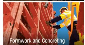
Formwork and Concreting