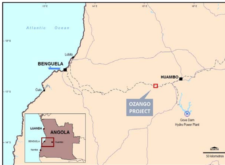
Figure 3: location of Ozango Project containing Longonjo REE prospect

The Longonjo REE prospect is located within the Ozango Project, approximately 600km southeast of the Angolan capital Luanda and 50km west of the regional city of Huambo. It is located proximal to good infrastructure including roads, towns and the recently recommissioned railway which links the area to the deep water Atlantic port of Lobito.