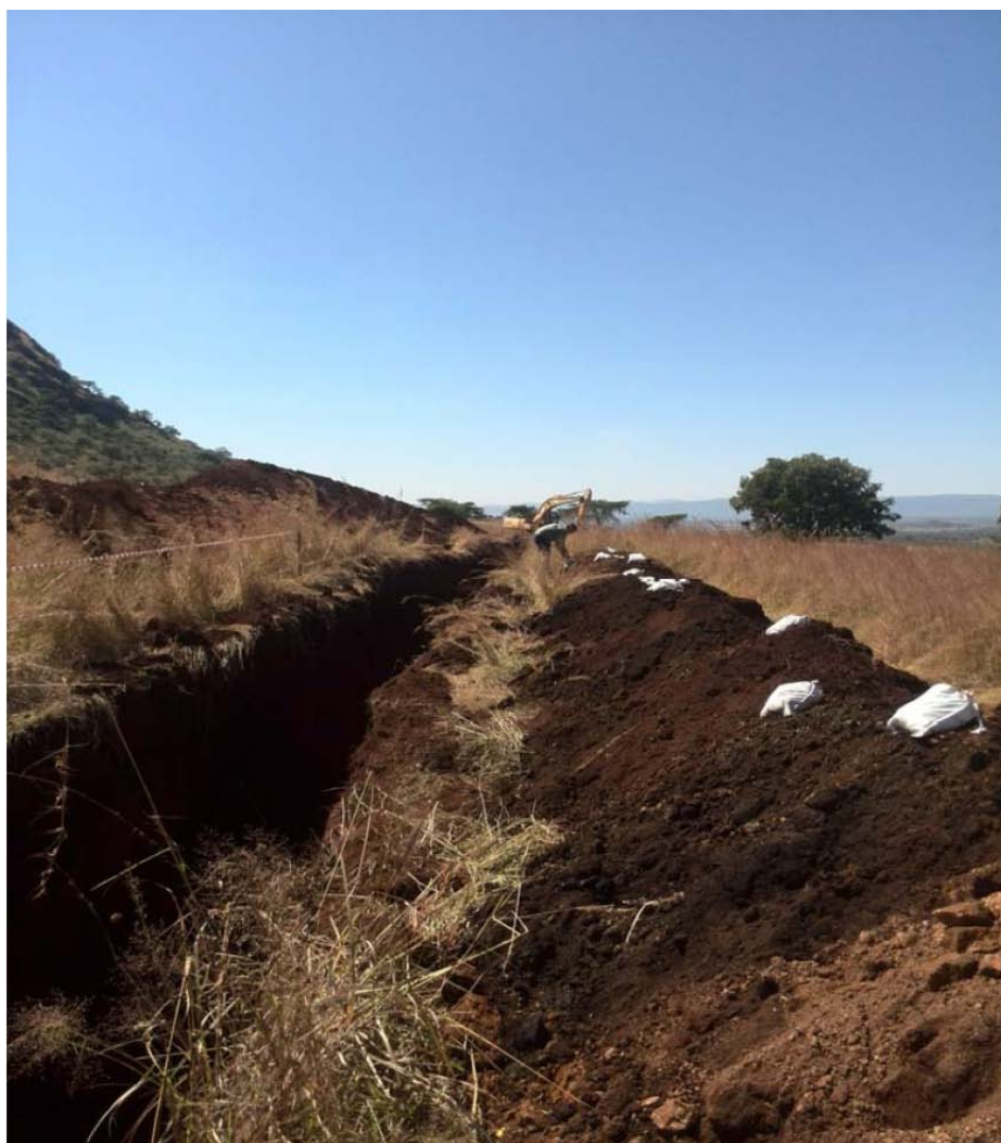
Fig 2: Trench sampling at Longonjo Rare Earth Prospect

Initial beneficiation bench scale rougher kinetic flotation tests have resulted in a stage 1 rougher concentrate containing 19.44% REO which represents a >3 times upgrade. Beneficiation testwork is continuing with the aim of improving both REO upgrades and recoveries. Upon the completion of beneficiation testwork hydrometallurgical characterisation testwork will be conducted on a beneficiated REO concentrate. The overall aim of this testwork program is provide data which will enable an indicative financial model to be completed as input into a broad project evaluation.