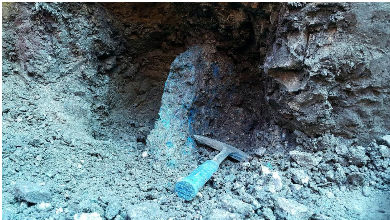
Figure 2: View of copper rich vein prior to sampling.