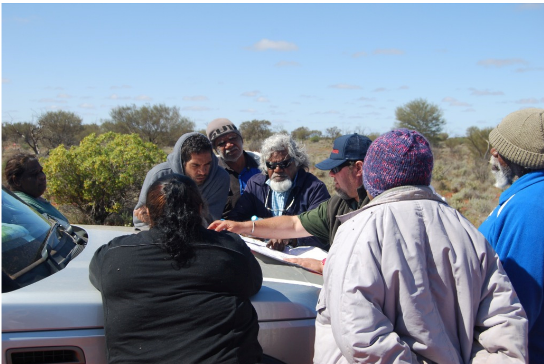
Figure 3 : Members of the Antakirinja Matu – Yankunytjatjara Aboriginal Corporation (AMYAC) discussing the proposed clearance with Tyranna Resources geologist