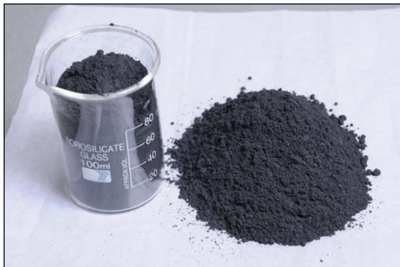
Figure 2. Example of reduced Graphene Oxide powder ( www.indiamart.com/united-nanotech/industrial-chemical.html )

Triton confirms the same Singapore laboratory has also successfully created Graphene powder from the TMG products by simply reducing (drying) the TMG Graphene Oxide solution. Once the Graphene powder has been created it is actually insoluble in water.