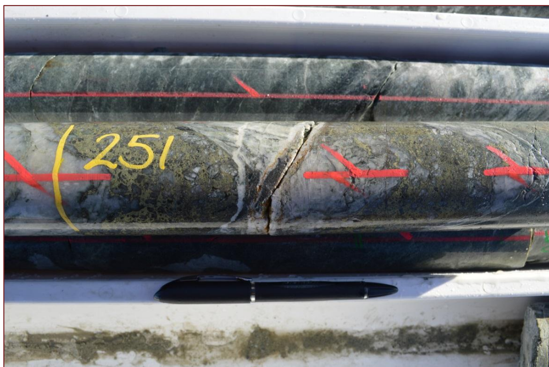
Figure 3. Chalcopryite mineralisation (4.48% Cu) in quartz veins at 251m.