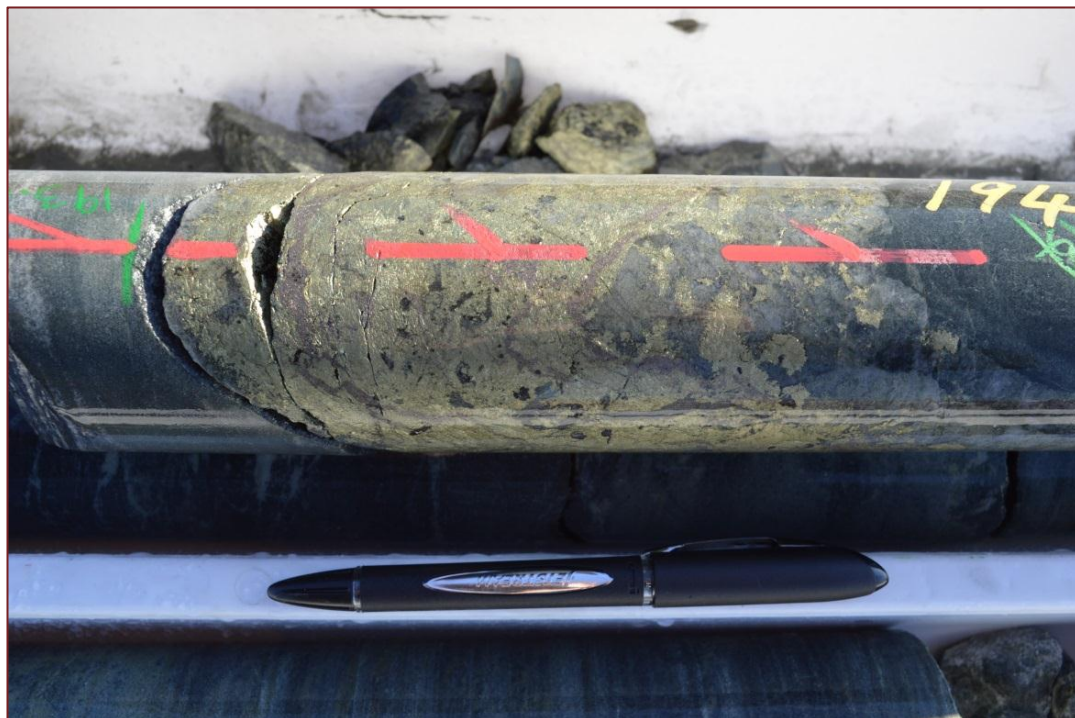
Figure 2. Massive chalcopyrite and pyrrhotite vein (10.1% Cu) cross cutting View Hill Amphibolite at 194m.

Complete hole details can be found in Table 1.