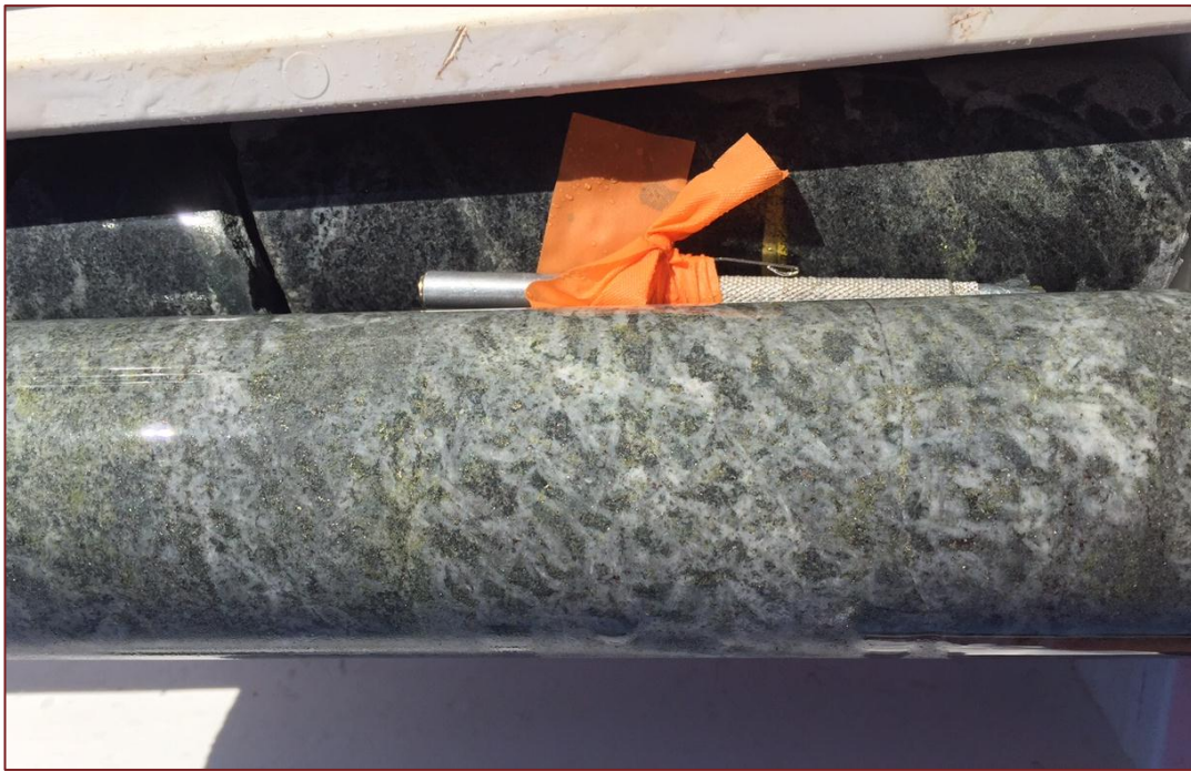
Figure 4. Pyrite – carbonate – quartz breccia alteration at 184m

A second hole (CZD0009) has been completed at One Tree Hill targeting a shallow, near surface EM conductor approximately 350m along strike from CZD0008. The conductor appears to be associated with pyrite-pyrrhotite and trace chalcopyrite zone identical to PGE anomalous zone in CZD0008. Assay results are pending.