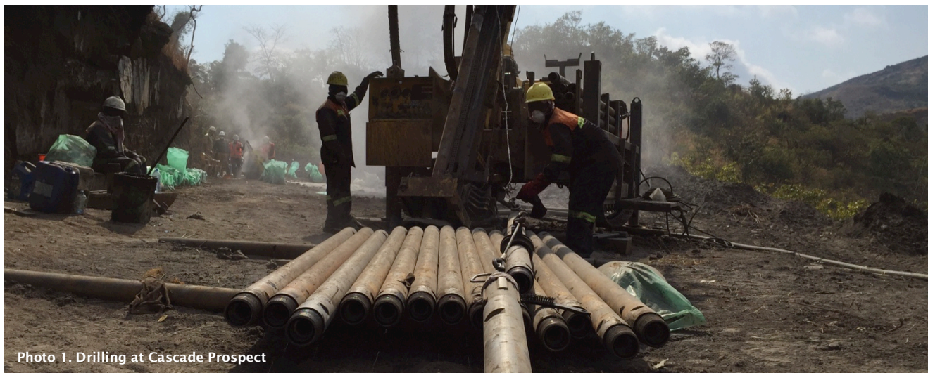
Photo 1. Drilling at Cascade Prospect

Drilling is currently underway at the adjacent Ulanzi prospect, where six holes have been completed and another six to eight RC holes are planned. Core from the first diamond holes at Ulanzi (DD14 &15) intersected over 80m of graphitic mineralisation. Assay results for the next two Cascade holes are expected by the end of September with a follow-up drill programme planned to commence in early October.