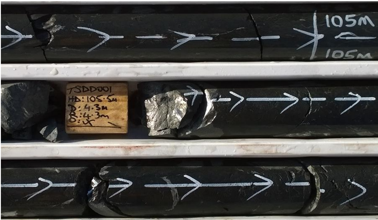
Figure 1. Section of TSDDD001 showing graphite at 105m down hole.