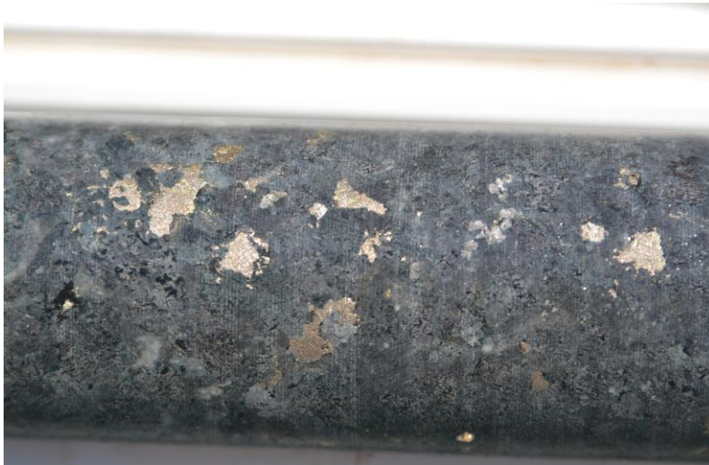
FIGURE 2: Globular sulphides within coarse grained mesocumulates at around 206 metres downhole in MRDD008.

Diamond holes MRDD006 and MRDD007 were drilled to intersect the bedrock conductor T19C01 based on detailed moving loop ground EM surveying conducted in the vicinity of T19C01.