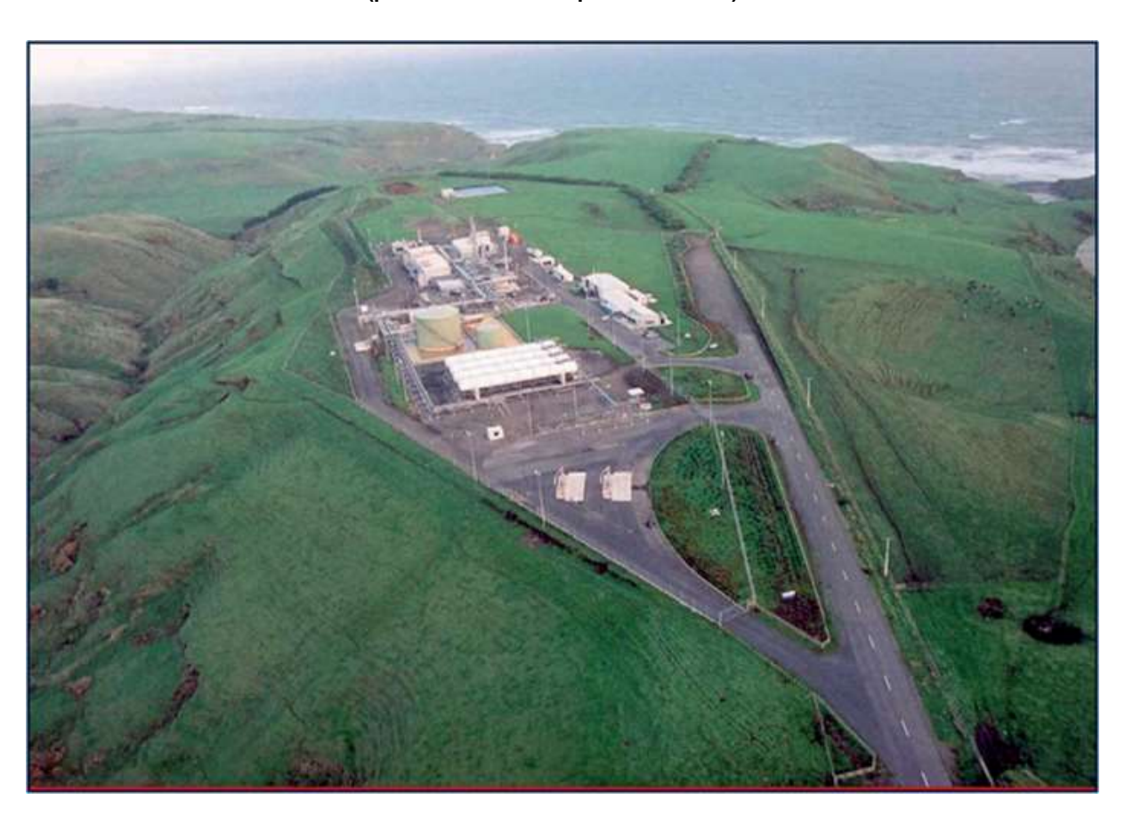
Picture 1: Rimu Production Station (part of the STEP acquisition assets)

The assets will be renamed the South Taranaki Energy Project ("STEP"). They have historically produced ~ 25 PJ of gas and 1.94MMbbls oil. The asset became available for sale as a result of Origin selling assets and focusing on its LNG export project in Queensland.