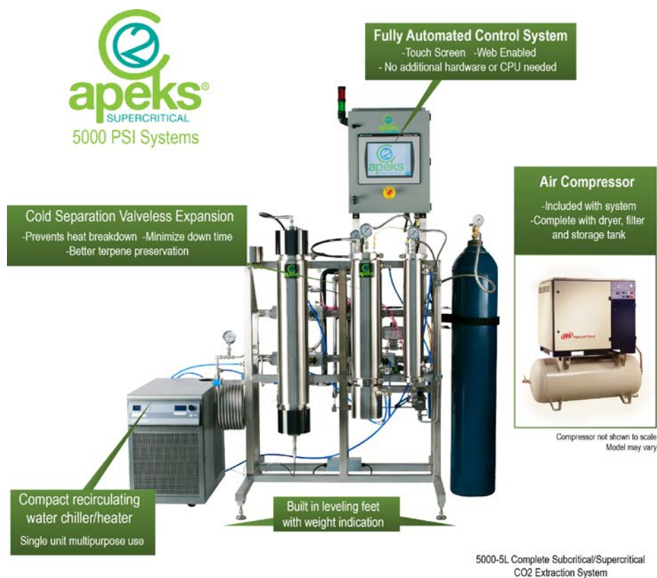
Figure 2. MGC's CBD Extraction System Equipment

MGC proposes to maintain all of its facilities as certified GMP (Good Manufacturing Practices), GAP (Good Agricultural Practices), and GLP (Good Laboratory Practices), as part of ensuring that only the highest quality product will enter MGC's supply chain and reach the customer.