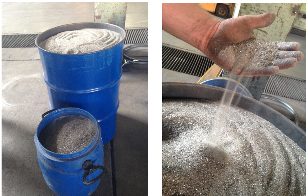
Figure 1: Lithium mica concentrate

The bulk sample was ground to 1,200 micron and run through a high intensity dry magnetic separator, producing concentrate weighing 420kg and averaging 2.5% Li 2 O. This concentrate was then ground to 80% passing 30 micron before packaging and transport to Australia for the planned lithium carbonate mini-plant run.