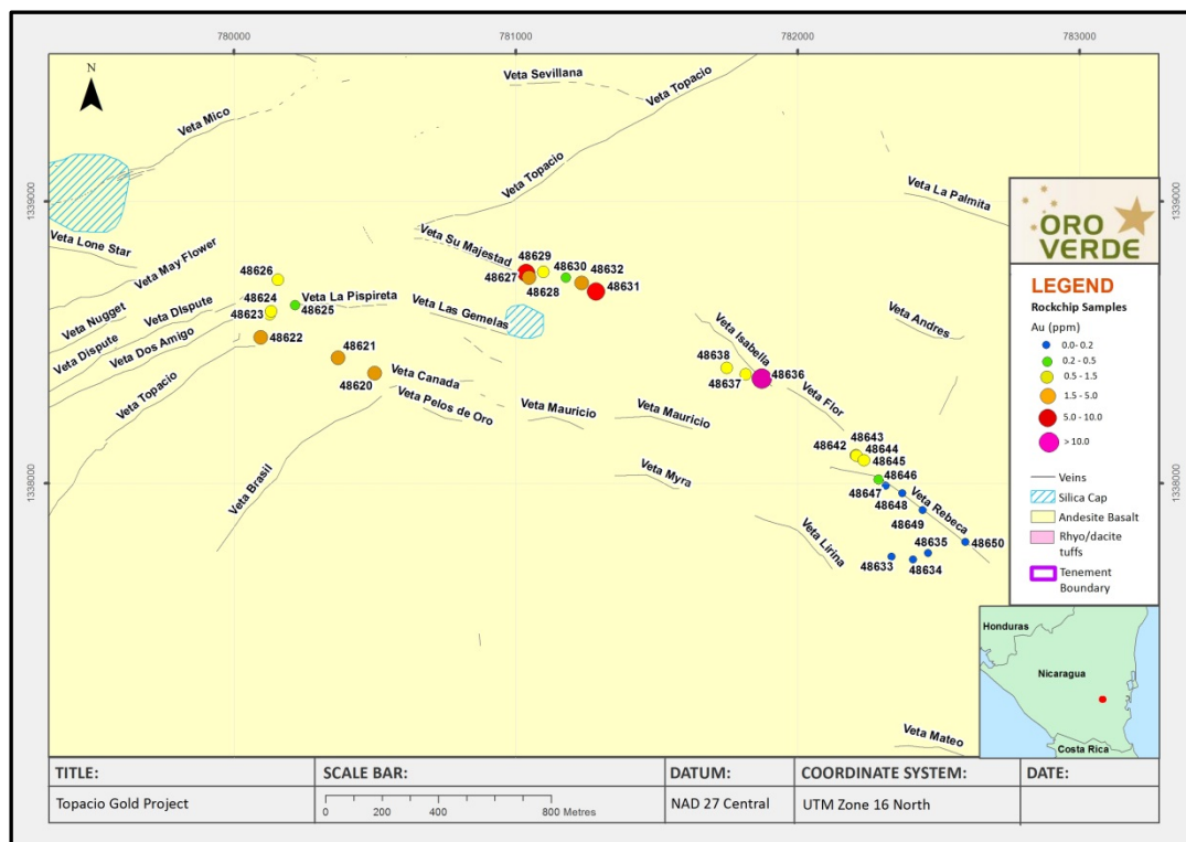
Figure 4 Topacio NE, Su Majestad and Isabella-Rebeca – Latest Oro Verde sampling results (in isolation)