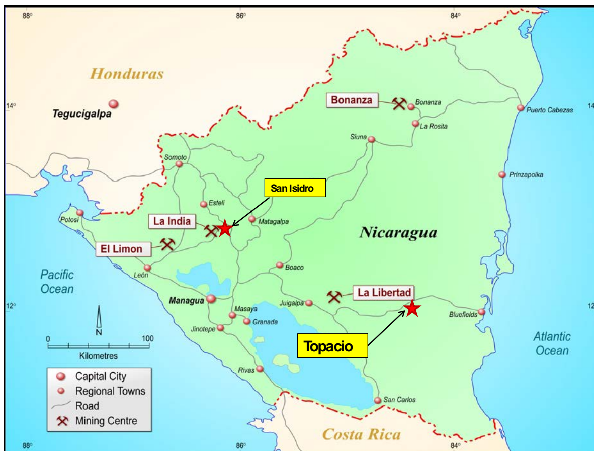
Figure 1 Major Nicaraguan gold deposits and the Topacio Gold Project (Central America)