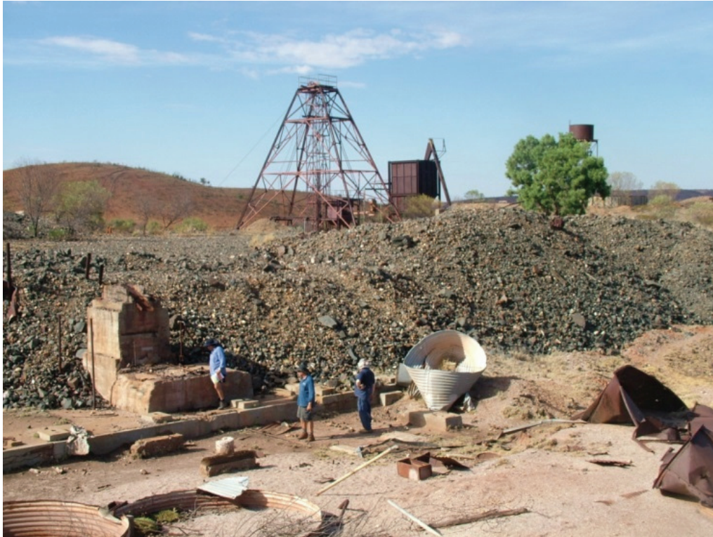
Figure 2, Pioneer Mine

The Hatches Creek project consists of two granted tenements occupying 31.4 km 2 (EL22912 and EL23462), which cover the entire historic Hatches Creek tungsten mining centre. Hatches Creek is a large historical high grade tungsten mining centre where mining was undertaken between 1915 and 1957. Previous recorded production is approximately 2,840 tonnes of 65% WO 3 .