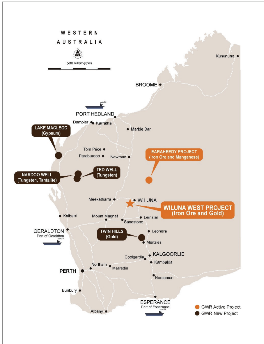
Figure 3 – Western Australian Project Interests