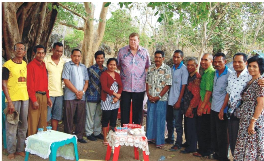
Local community land owners

The company has agreed a Memorandum of Understanding with the local community land owners to lease the block for 50 years. The company now awaits approval for this lease from the local Regency.