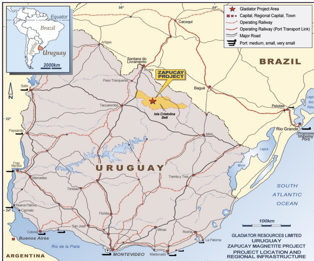
Figure 1: Location of the Zapucay Project and the Isla Cristalina Belt (ICB) in Uruguay