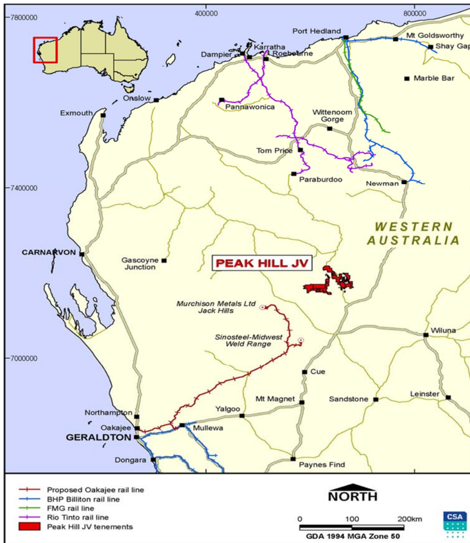
FIGURE 1 Project Location

The location of the Telecom Hill Mining Lease is shown in Figure 1