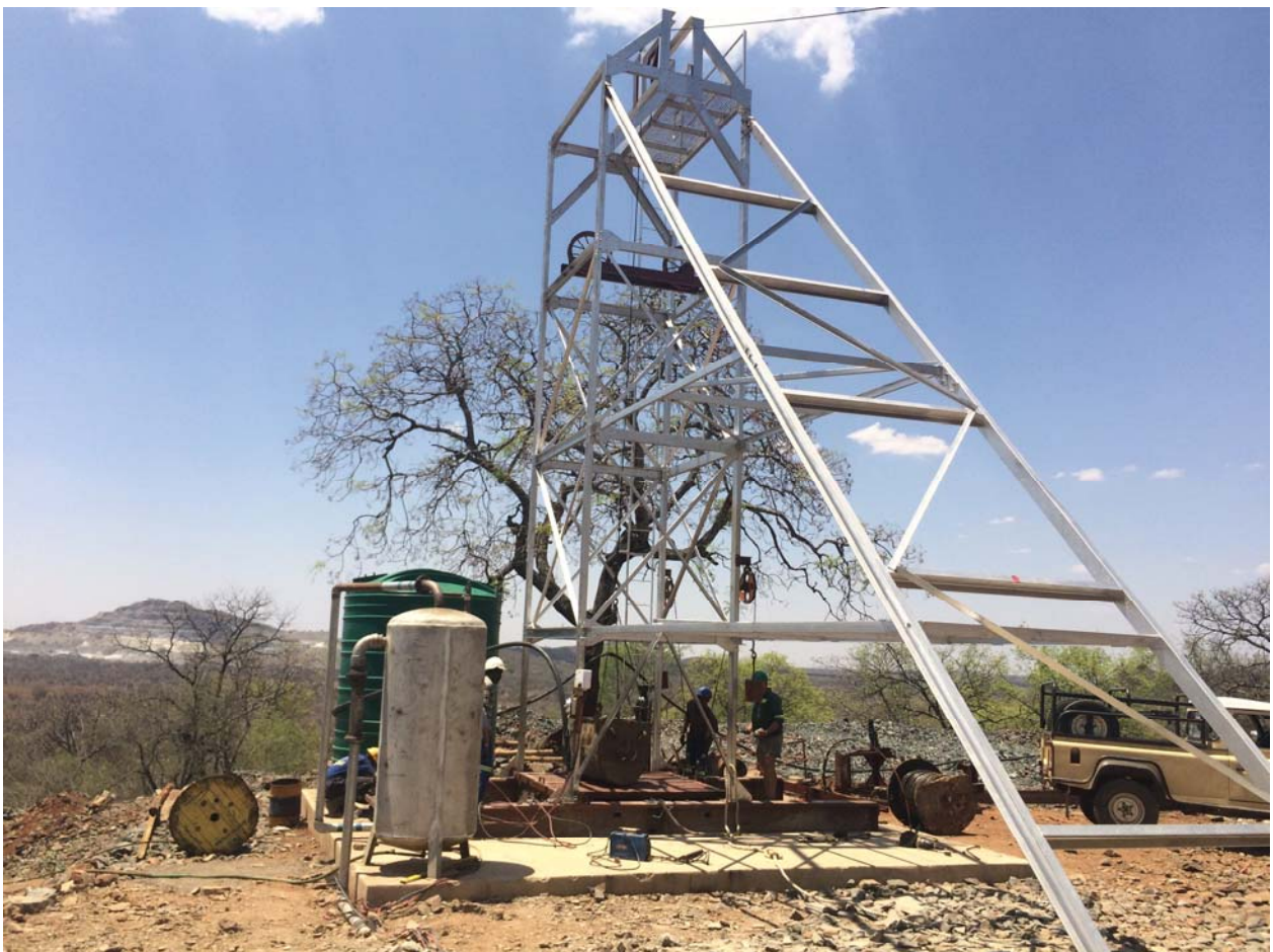
Figure 1: Prestwood Gold Mine headframe and infrastructure