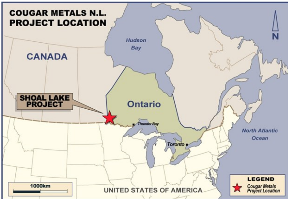
Location of the Shoal Lake project area in the north-western portion of the Province of Ontario

Discovery of gold in the Shoal Lake area was made during the late 19 th century gold rush and led to the development of a number of gold deposits in north-western Ontario. At Shoal Lake, mining of gold commenced in 1893 and continued intermittently until 1936 when the regional focus changed to other developing gold belts within Ontario and in North America.