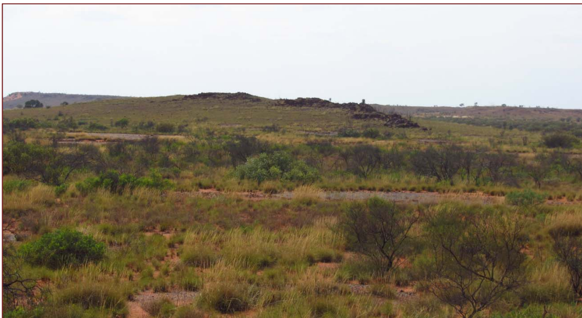
Figure 4. Iapetus gossan forming a prominent ridge