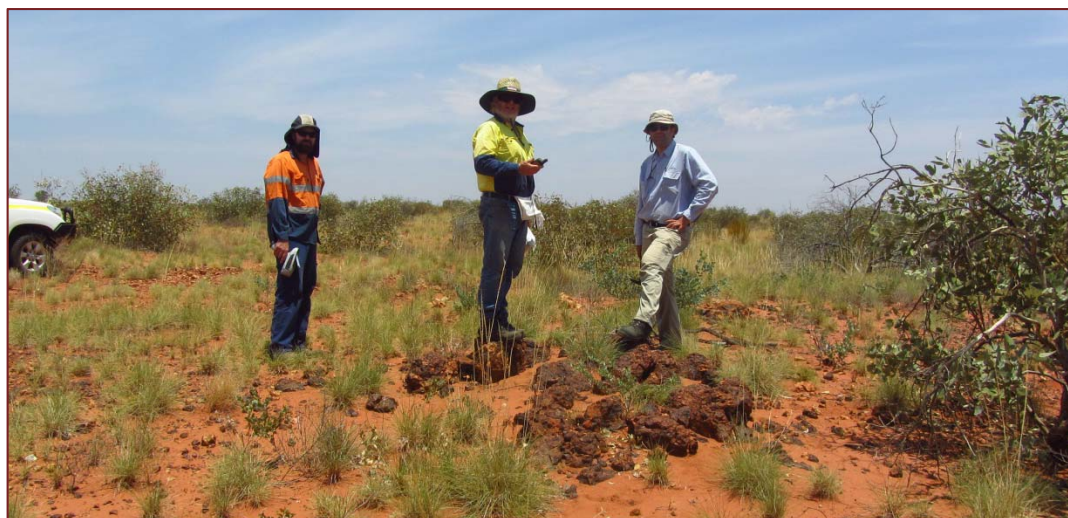
Figure 1. Cassini team at one of the gossans at the Enceladus Prospect

This discovery is based on analysis of soil and lag geochemical data and the subsequent identification of gossan outcrops during field reconnaissance in late October 2015.