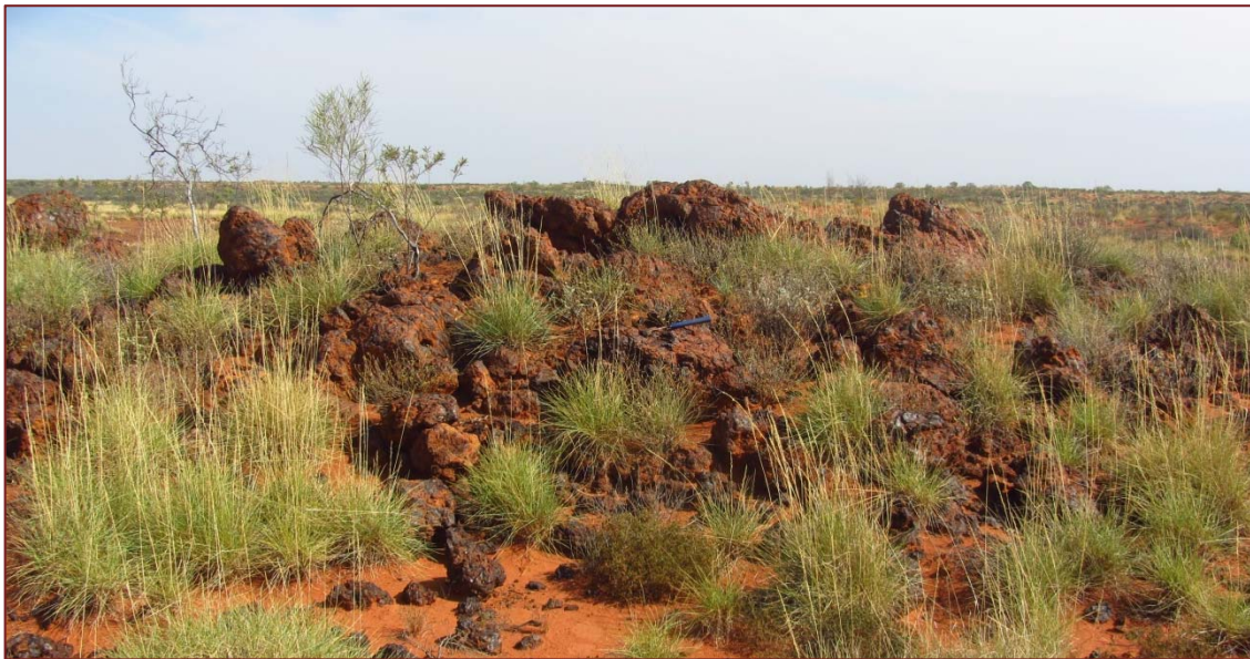
Figure 3. Iapetus gossan