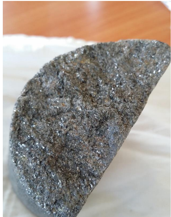
Photo 1: HQ3 drill core (diameter 61.1mm) from holes LJDD002 and LJDD003 highlighting large visible flake sizes.