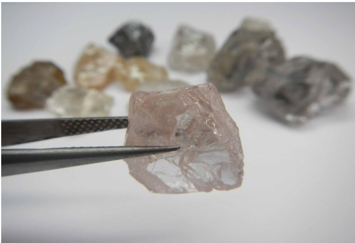
14.28ct pink diamond recovered from Mining Block 8