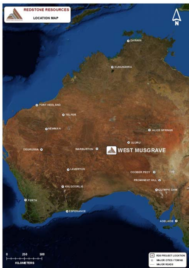
Figure 1– West Musgrave - Location Map

The Project consists of a large swarm of hydrothermal copper rich quartz veins in a mineralised system covering an area at least 5km 2 . Malachite rich gossans associated with quartz veins are exposed at the surface and form part of a dilatational system between two major structures within the Tollu Fault Zone.