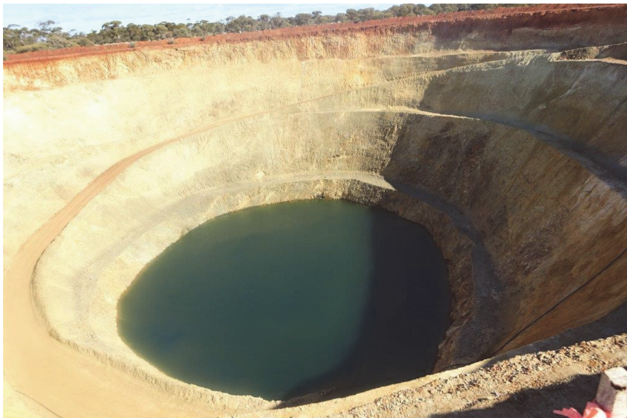
Figure 1 – Halleys East Pit – June 2015

The Company expects that milling campaign six will commence during the March 2016 quarter.