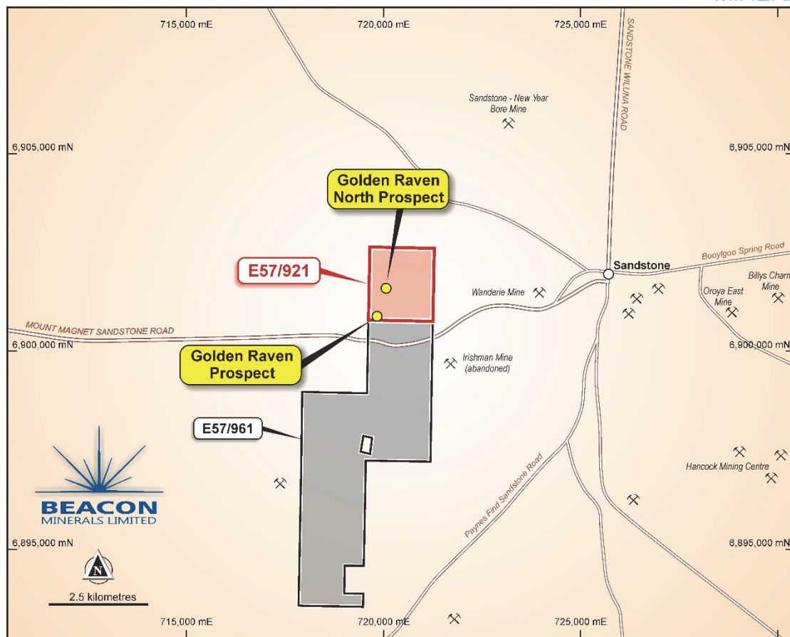
Figure 3 - Sandstone West Project Tenure and Location of Prospects