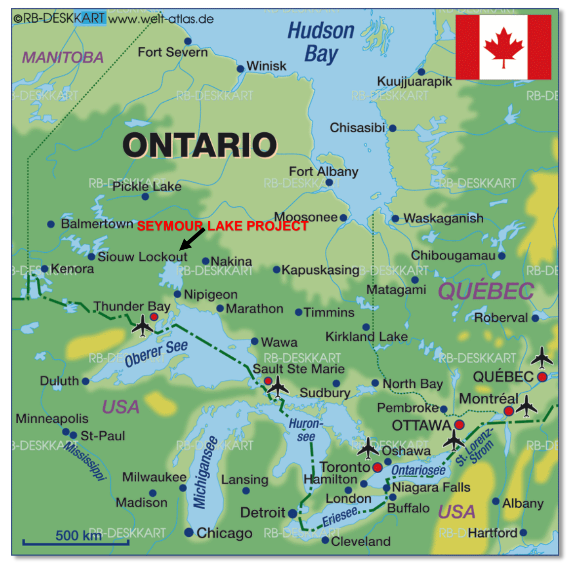
Figure 2: Location of Seymour Lake Project (approximately 230km north-northeast of Thunder Bay)

The upcoming drilling program is the key component of the Company's due diligence review of the project.