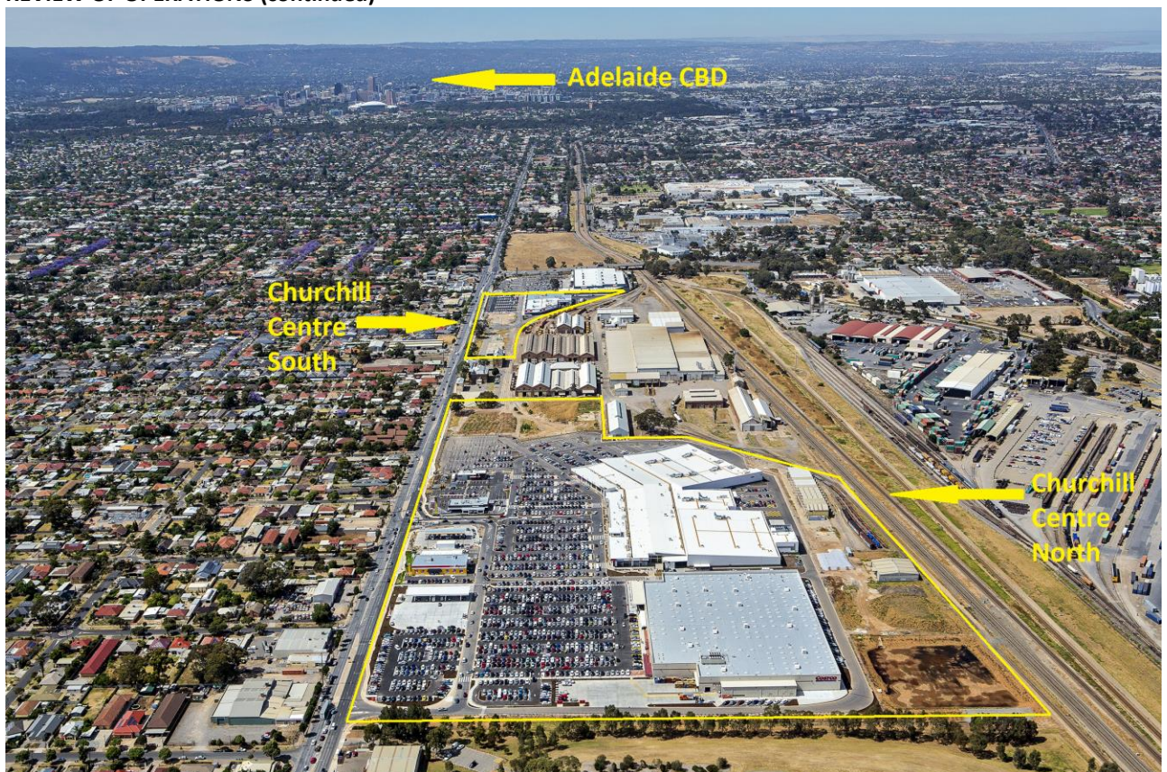
Churchill Centre project looking south towards Adelaide CBD