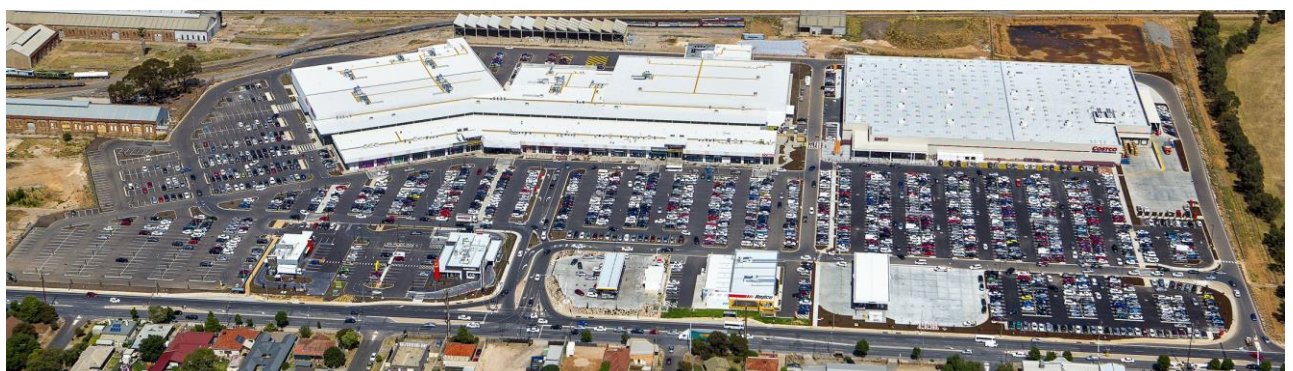
Churchill Centre North

Axiom's intention is to continue to own its 50% share of the Churchill Centre North to provide a stable and sustainable cashflow for the Company through rental revenue received. The Centre also contributes substantially to the Group's balance sheet through its net equity investment in the Centre.