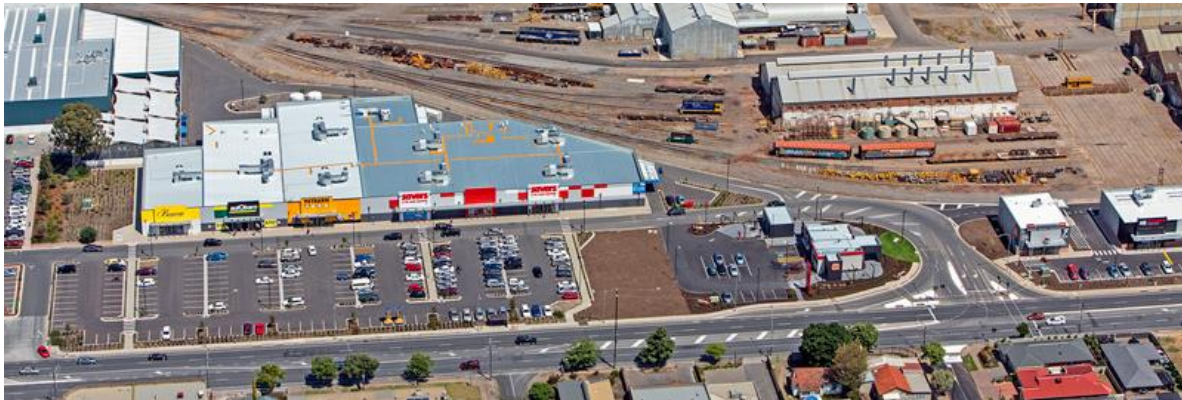
Churchill Centre South