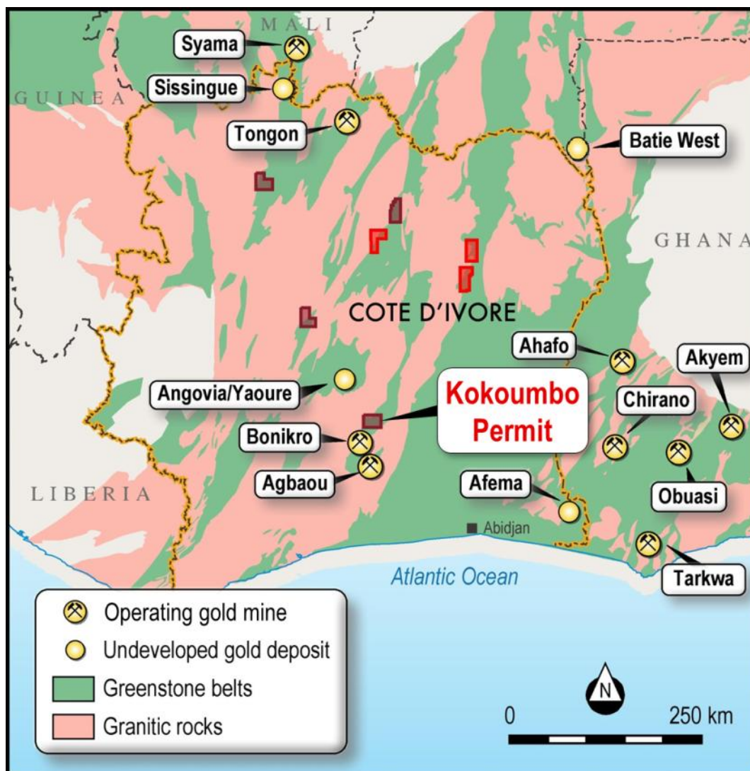
Figure 2: Locality map showing location of Kokoumbo permit and PDI's other exploration ground interests in Cote D'Ivoire. The Toro joint venture permits are shown in brown and the ground covered by PDI's agreement on the Bobosso Project with the Ivoirian company, XMI SARL, is shown in red.

Predictive is in Joint Venture with Toro Gold Limited ( Toro ), a UK-based company, on four permits in Cote D'Ivoire (Figure 2). Under the terms of the Joint Venture agreement, Toro can earn a 51% interest in Predictive Discovery Cote D'Ivoire SARL (Predictive CI), which holds Predictive's interest in the four permits, by spending US$1 million on exploration and option payments. Once Toro has achieved its 51% interest, PDI may contribute 49% of expenditure from then on or dilute. If PDI decides to dilute, Toro can earn a further 14% in Predictive CI by spending an additional US$2.5 million on exploration of the ground, leaving PDI with a 35% holding.