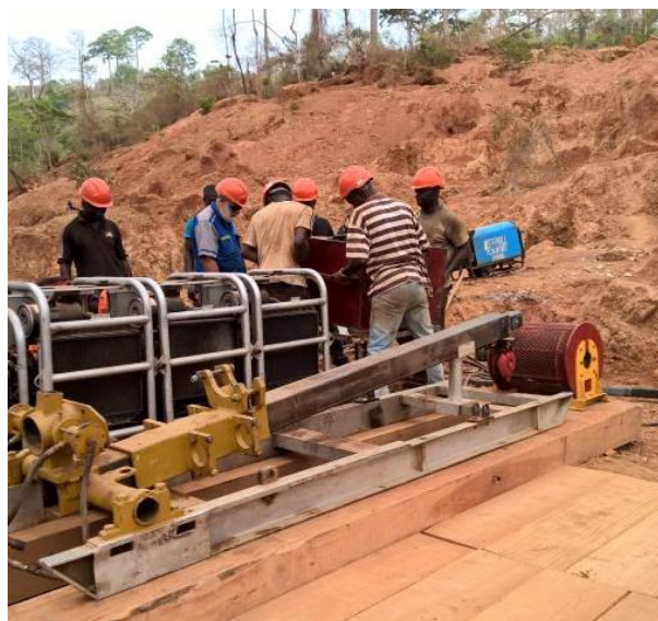
Figure 1: Portable diamond drill rig being set up on first drill site at Kokoumbo. Note large area of bedrock exposure in the background generated recently by artisanal miners.

Toro's work has advanced rapidly on the four joint venture permits in Cote D'Ivoire. With RC drilling planned for the northern Boundiali permit in April, we can expect significant newsflow from two drill programs in the coming months."