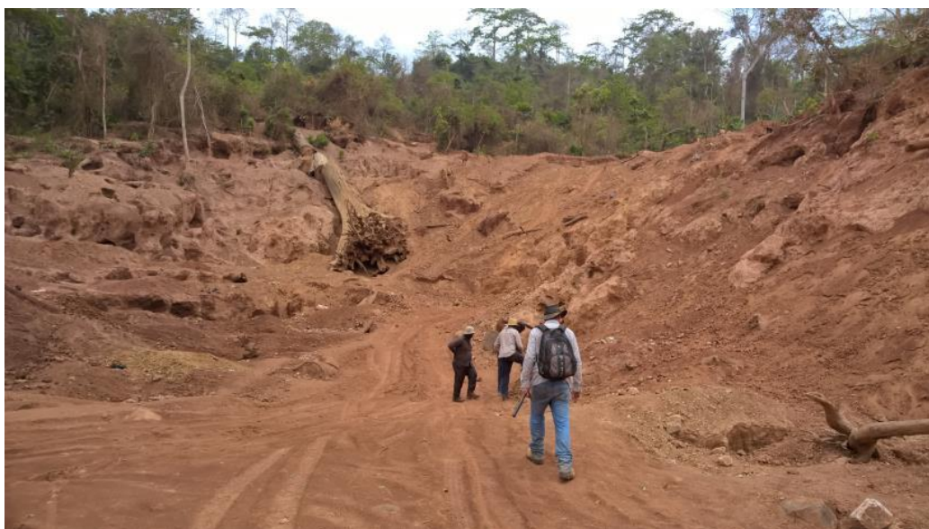
Figure 4: Toro and Predictive geologists examining exposures created by recent artisanal mining activity on Kokoumbo Hill.

Predictive Discovery Limited (PDI) was established in late 2007 and listed on the ASX in December 2010. The Company is focused on exploration for gold in West Africa. The Company's major focus is in Burkina Faso, West Africa where it has assembled a substantial regional ground position totalling 1,500km 2 and is exploring for large, open-pittable gold deposits. Exploration in eastern Burkina Faso has yielded a large portfolio of exciting gold prospects, including the high grade Bongou gold deposit on which a resource estimate was calculated in September 2014. PDI also has interests in a strategic portfolio of tenements in Côte D'Ivoire covering a total area of 2,700 km 2 .