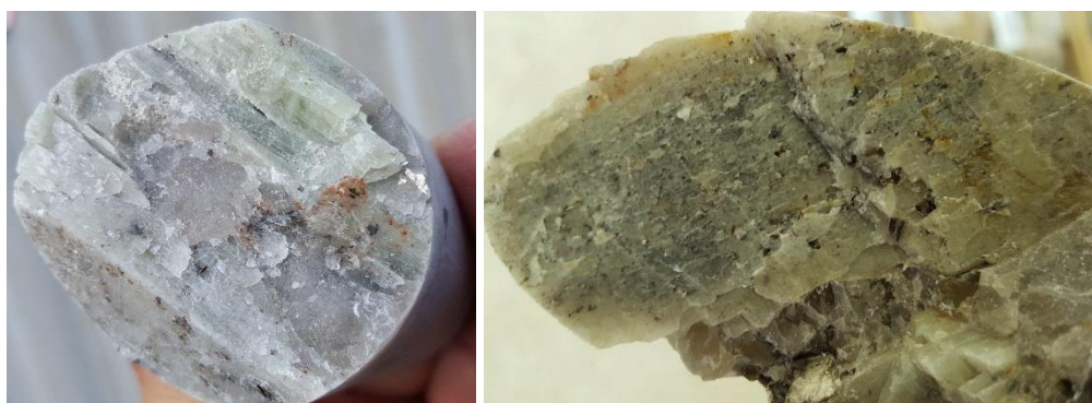
Figure 1. Various forms of Spodumene crystals identified in the drill core samples from the Seymour Lake project.

The initial logging of the drill holes has immediately confirmed the strong presence of spodumene at the Seymour Lake Project, with more than 50% of the drill core (142m) being readily identified as spodumene pegmatite.