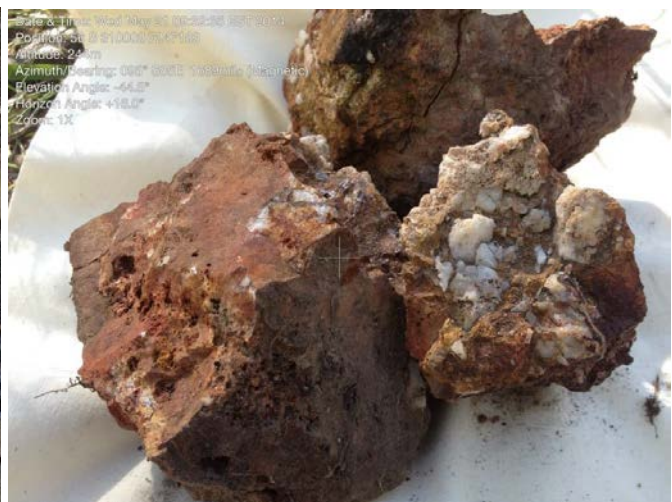
(Figure 1. Rock chips between Little Wonder and Cannindah East workings)