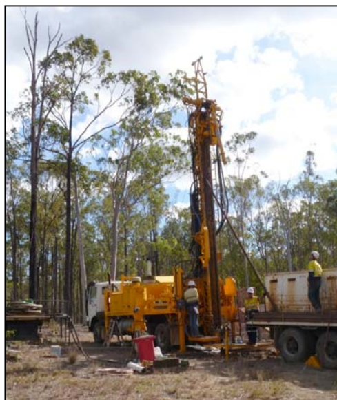
Drilling in T9 West Resource Extension Area