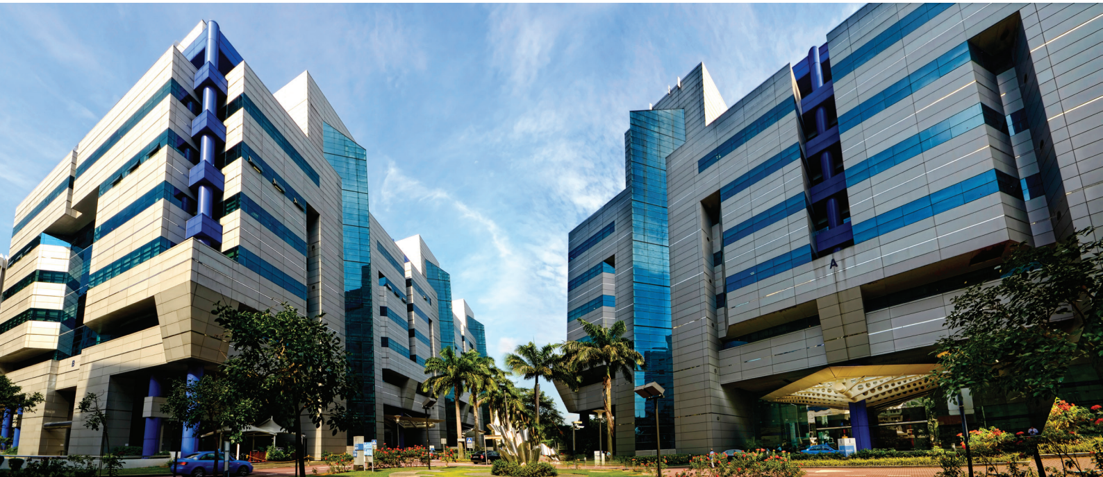
Alexandra Technopark, Singapore.