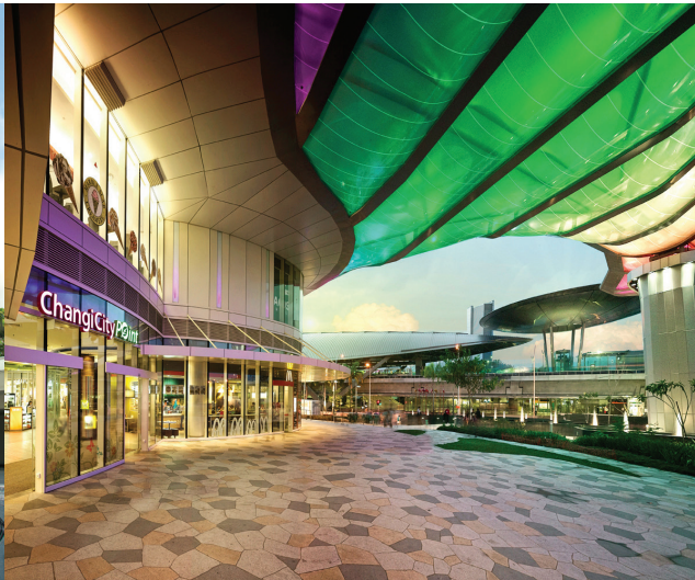
Changi City Point, Singapore