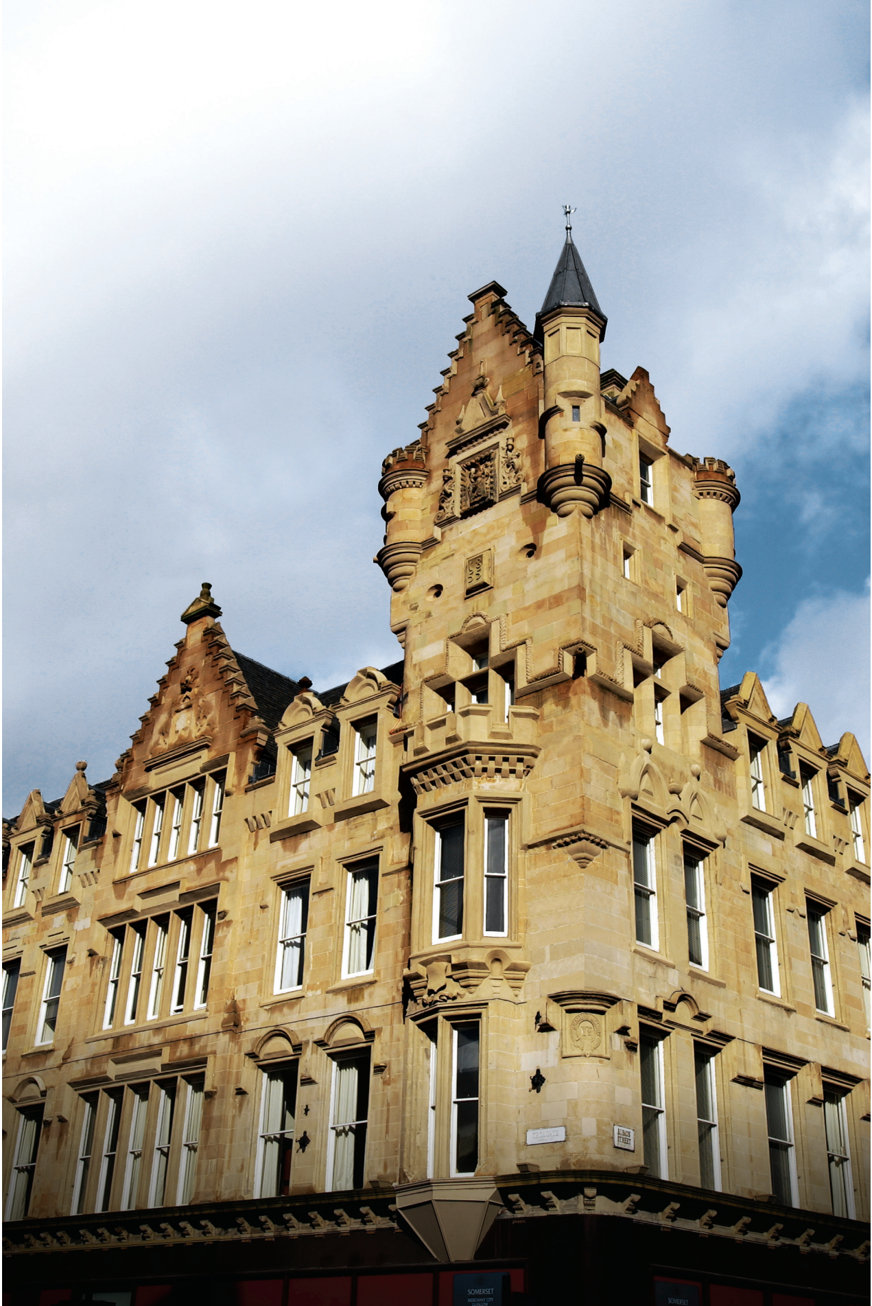
Fraser Suites Glasgow, UK.