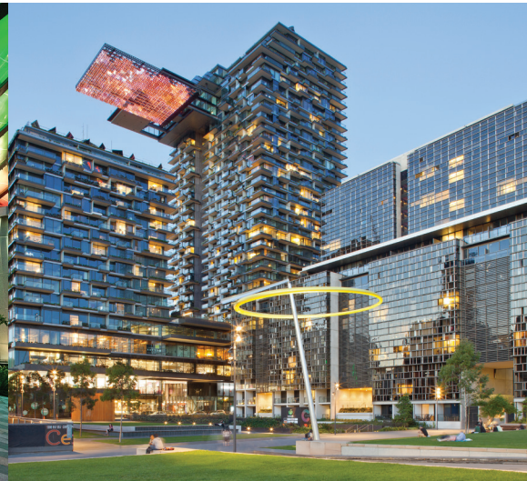
One Central Park, Sydney, Australia