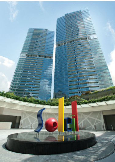
Soleil @ Sinaran, Singapore