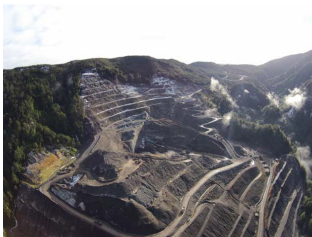
Cascade Mine Site

Coal tonnage was above target for the quarter. Production during the month concentrated on coal winning from the 'Cut 2' block and overburden removal in 'Cut 4' which is the next target for coal production. Rehabilitation planting on final landforms within the main pit area was completed with 8,848 plants established. The coal storage and handling area for Cascade has relocated to a new site at Coalbrookdale and the former area at Denniston has been rehabilitated.