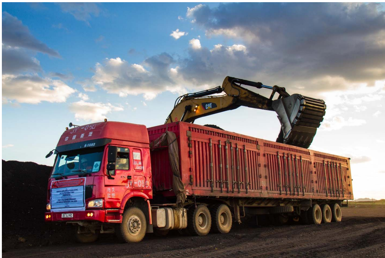
Coal loading underway

This significant milestone comes after 9 months of negotiations with regulatory approval agencies in Mongolia. The final piece of the jigsaw was sign off on a permit to utilise a 98 kilometre haul road linking the BNU mine to the Chinese border crossing at Shivee Khuren/Ceke. It signals the critical next phase of progress to a commercial mine operation.