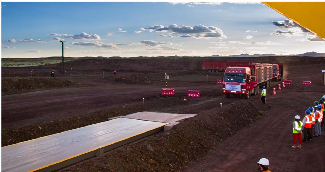
First coal from the Terra Energy BNU mine in Mongolia heads to a weigh bridge.