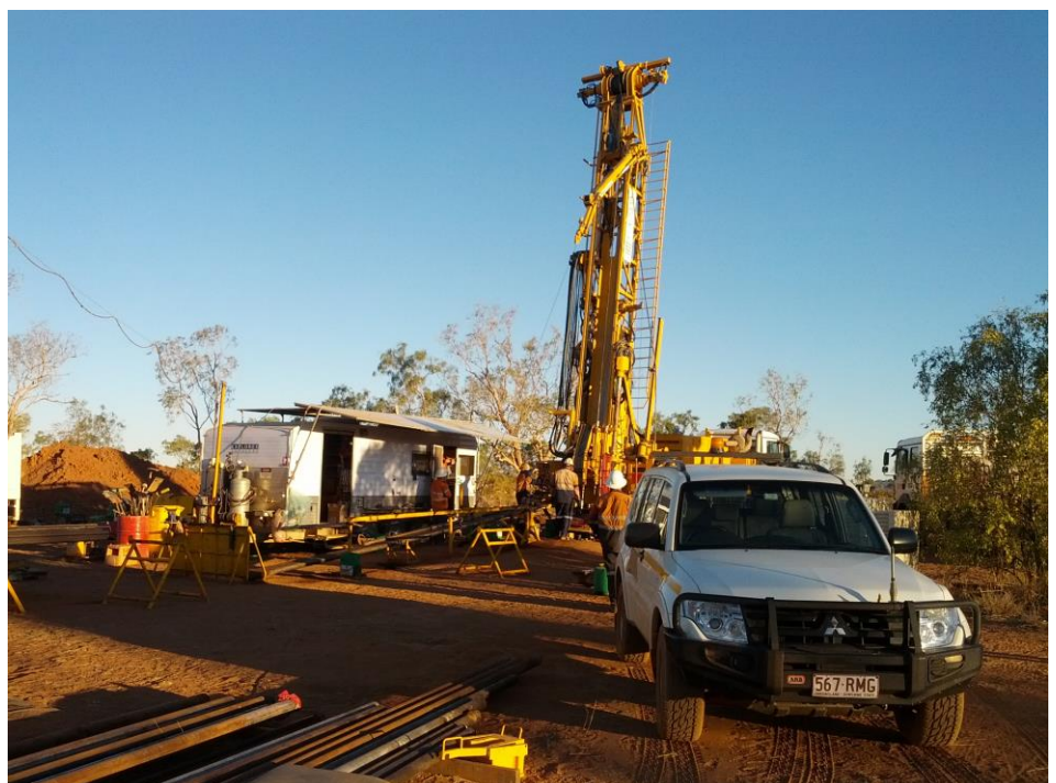
[Figure 1] Maronan Project: Drilling in progress

The Company has now commenced the second planned hole MRN14002 which is designed to test for mineralisation at about 200 metres vertically below and 100 metres further south of the significant mineralisation in MRN13002 (Figure 2). Dependent upon the amount of directional drilling this should be achieved within about four weeks.