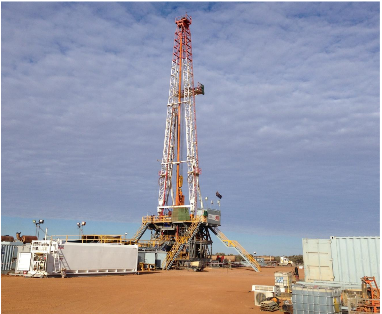
Figure 1 – Photo of Ensign rig at Tamarama 1