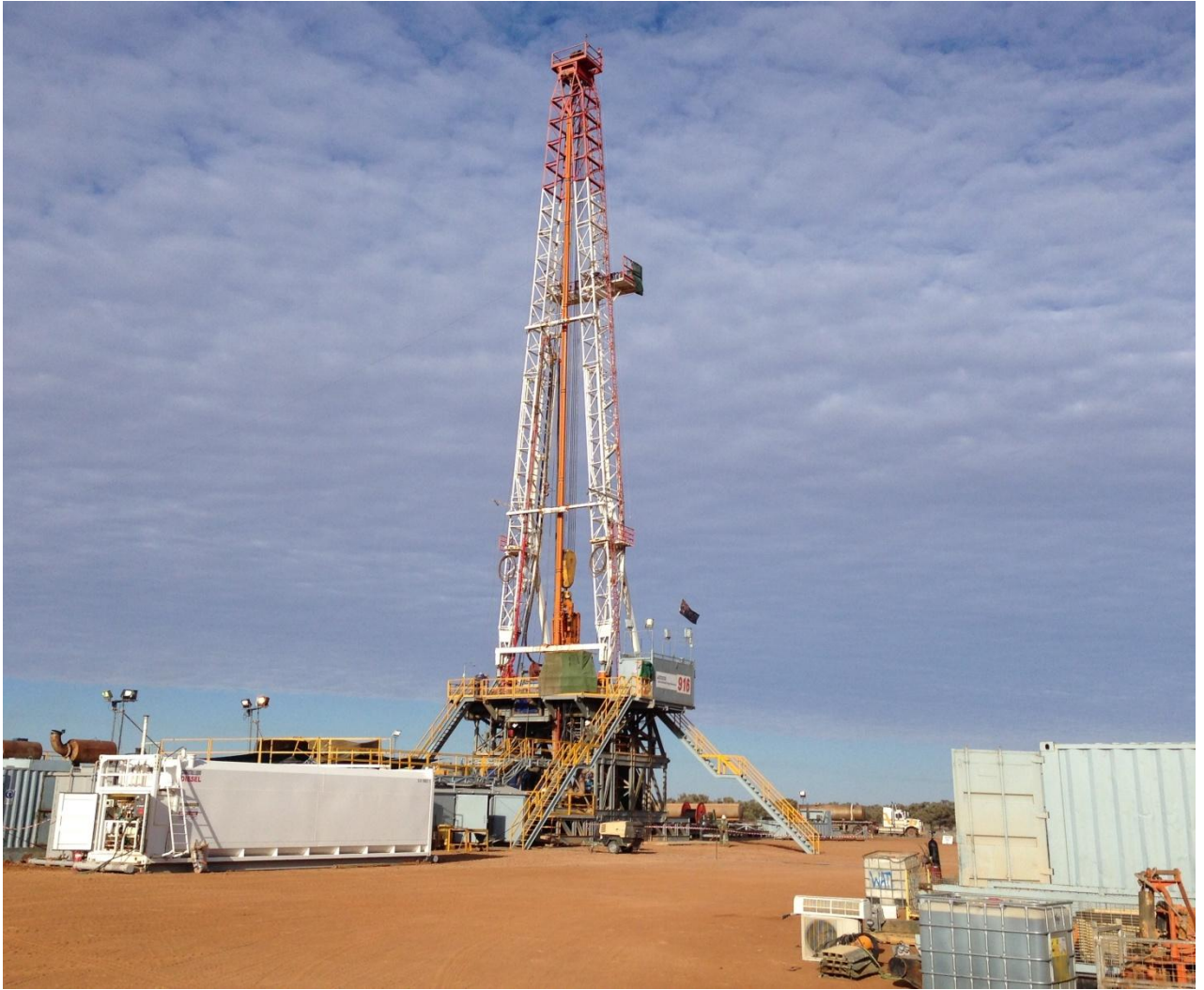
Figure 1 – Photo of Ensign rig at Tamarama 1