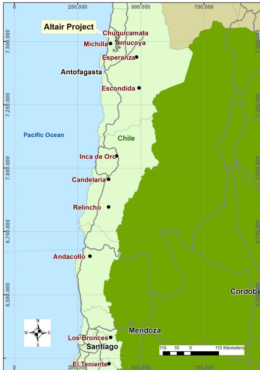
Figure 2: The Altair Project is situated close to the coast in Region II, northern Chile.