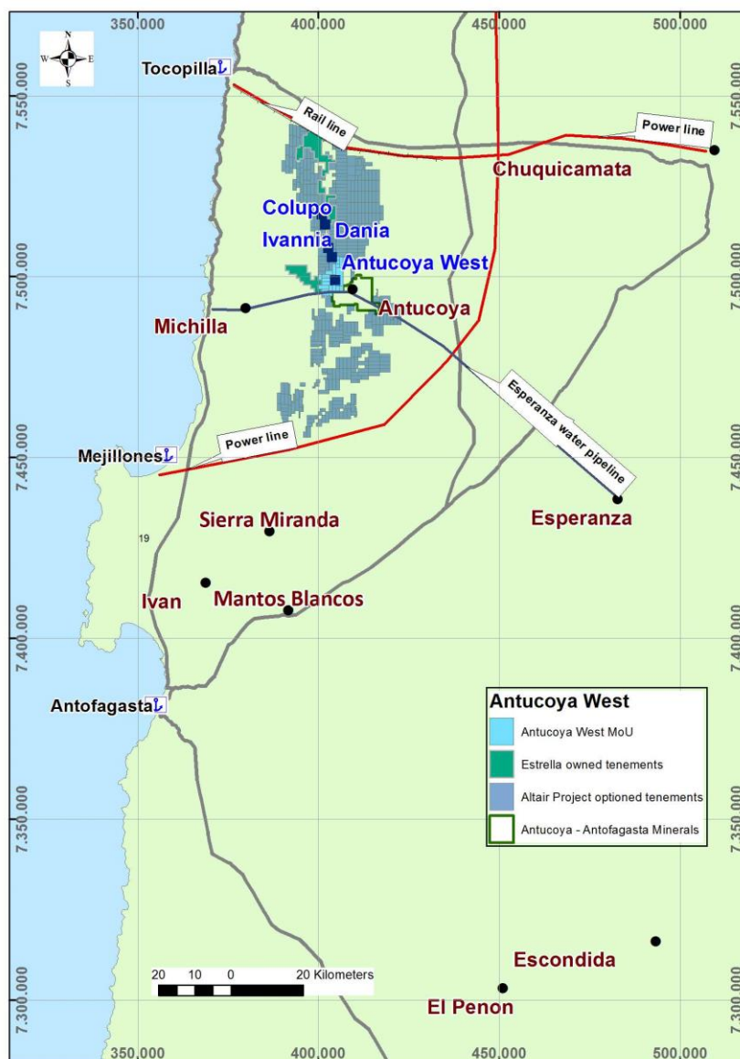
Figure 1: Estrella's Altair Project (which includes Antucoya West) lies within a well-established mining district in northern Chile; close to infrastructure and close to the Chilean coastline.