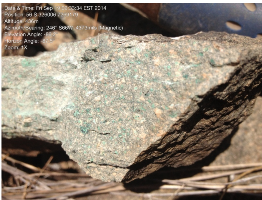
Figure 3. Copper bearing porphyritic dyke. Rock Chip 3011274 (0.87% Cu)