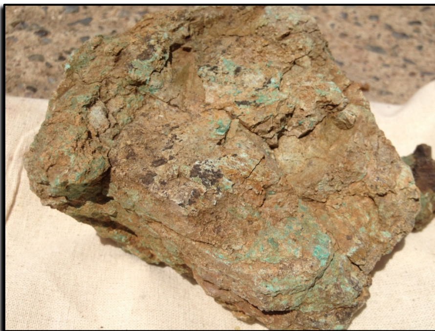
Figure 4. Strong Copper Oxides developed in brecciated sediments adjacent to porphyritic dyke. Sample 3011273 (24.2% Cu)