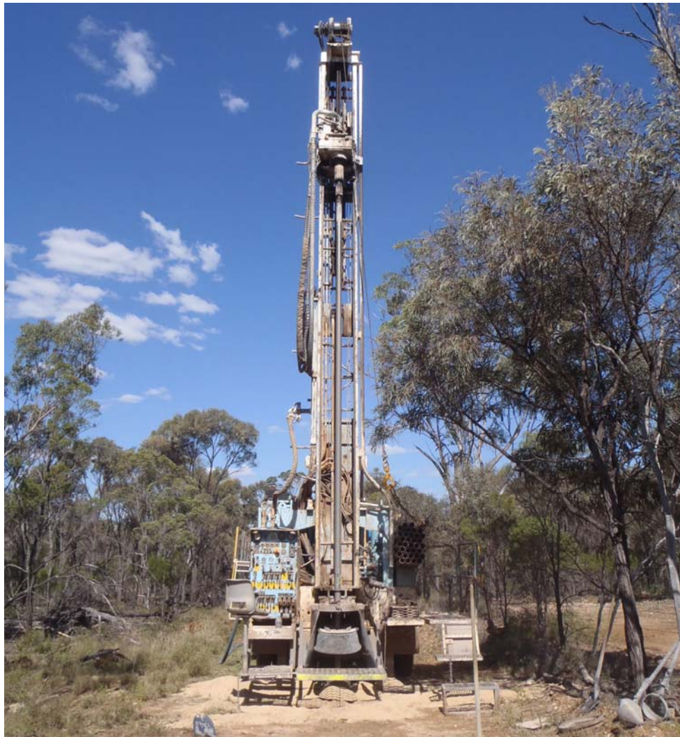
Photo of recent drilling activities conducted at Cuesta's Moorlands Project (MLW001)

The Company is targeting completion of a draft of the DFS by the end of this year. The DFS will be presented in both English and Mandarin versions, for the primary purpose of providing flexibility in obtaining project finance under the best commercial terms for the Company.