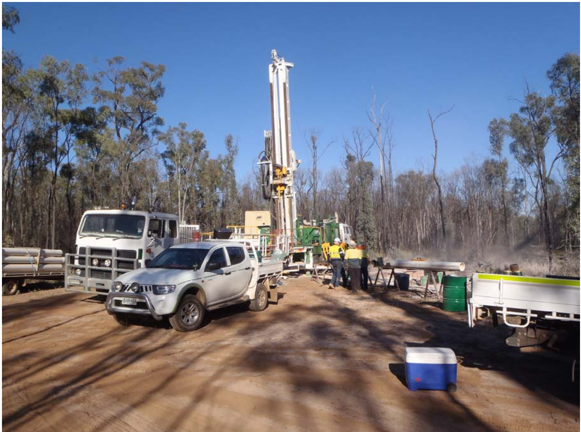
Photo showing recent drilling activities at Cuesta's Moorlands Project

At the end of September 2014, Cuesta had cash and cash equivalents of $8.0m.