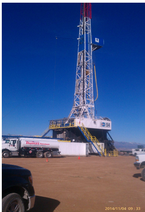
TWP USG #1

Tellus Resources Ltd ("TLU" or "the Company") is pleased to provide the weekly drilling operations summary below on the TWP USG #1 well. The well is the first in a two well farmin program in the Covenant Mondo conventional oil play located in Sevier County, Utah, USA.