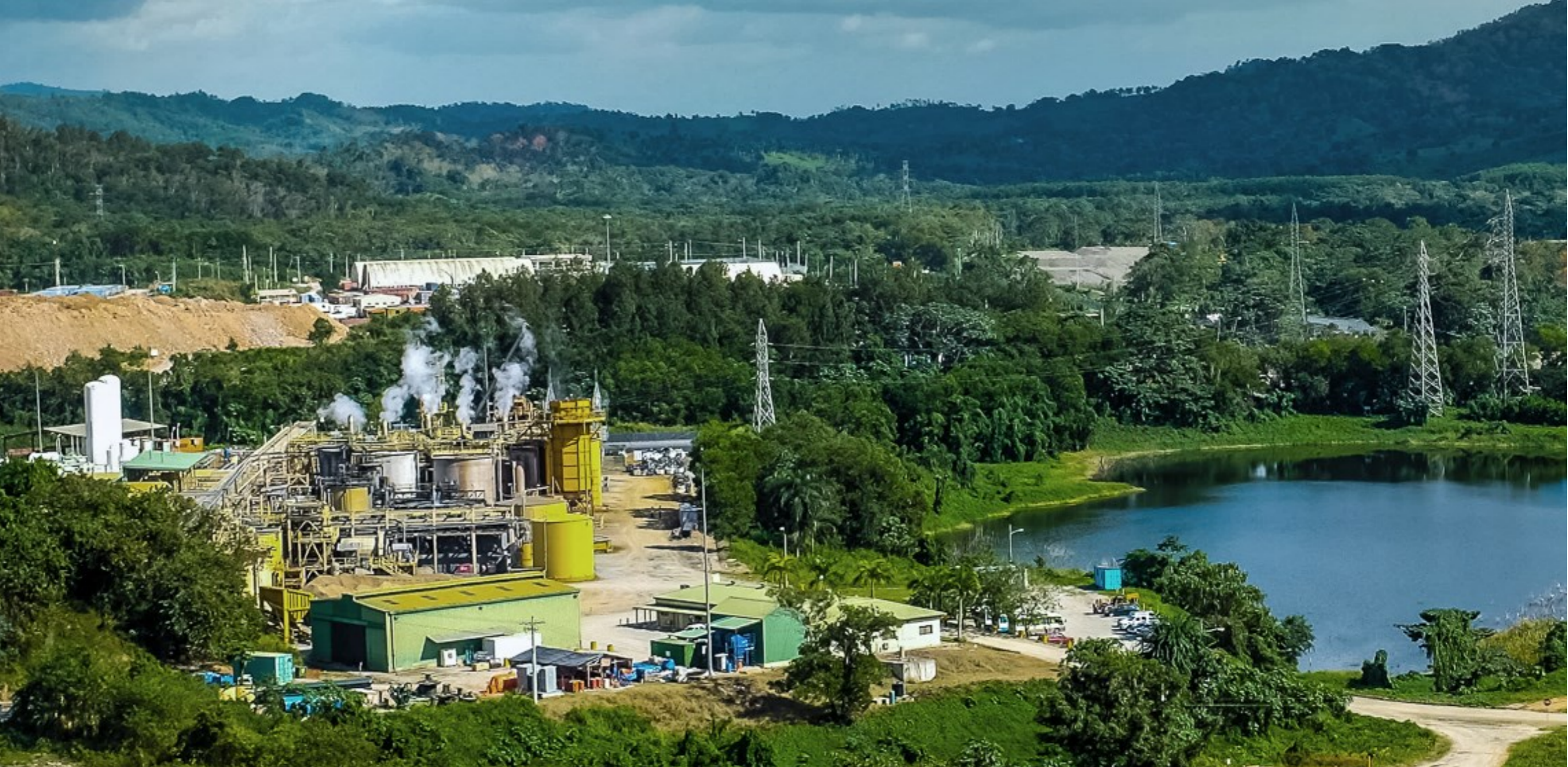
Las Lagunas Albion/CIL Process Plant, Dominican Republic